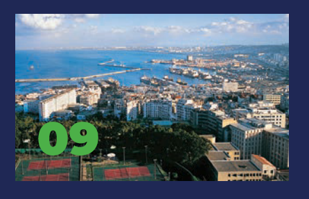
Algeria claims the title as the largest African country by size, at 2,381,741 Km square (919,595 sq. mi).