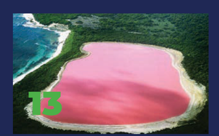
There's a pink lake in Senegal known as Lac Rose!