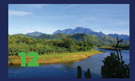
The country of Madagascar is the fourth largest island in the world.

The African culture is diverse: African arts and craft include sculpture, knitting/weaving, beading, painting, pottery, jewelry, headgear and African attire. African culture varies not only from one country to another, but also within each country, each ethnic group have customs, practices, and beliefs that are unique to their culture.