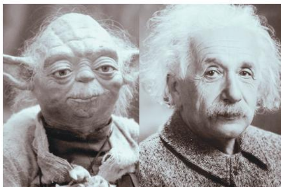
[Miratico.com | July 2022]

Stop by Creative Carpet & Flooring to claim your prize by May 31, 2023!