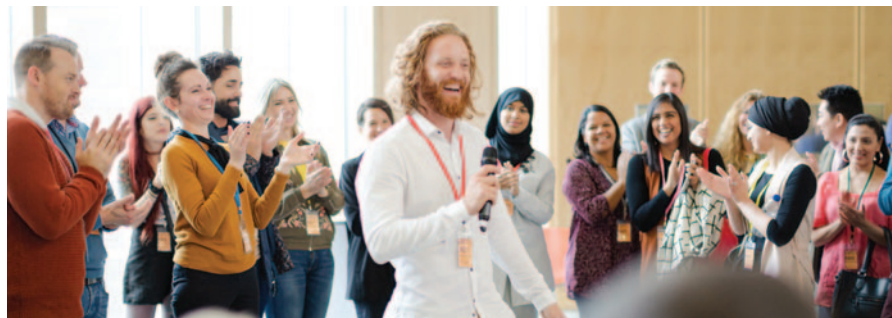
Community Education projects and courses take place in many locations countywide in partnership with community and voluntary groups and agencies.

Women's groups, Mens groups, Parenting groups, Older persons groups, New Communities, Networks, Health Service Executive, Tusla, Child and Family Agency, County Councils, Home School Liaison Projects, Community Development Projects, Traveller Projects and Partnership Companies.