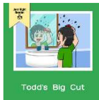
Todd's Big Cut

More reading and writing fun at JustRightReader.com!