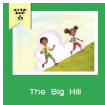
The Big Hill