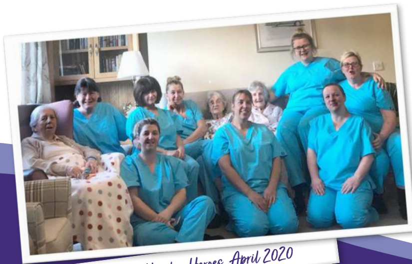
Our Hendra Heroes. April 2020