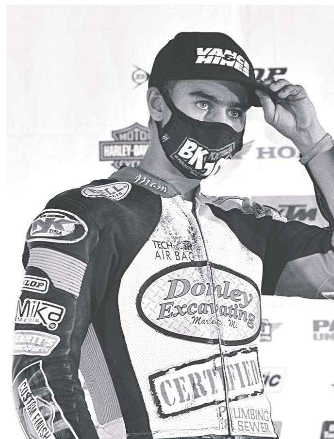
▲ The Clifford Road Kid has a bright future in store