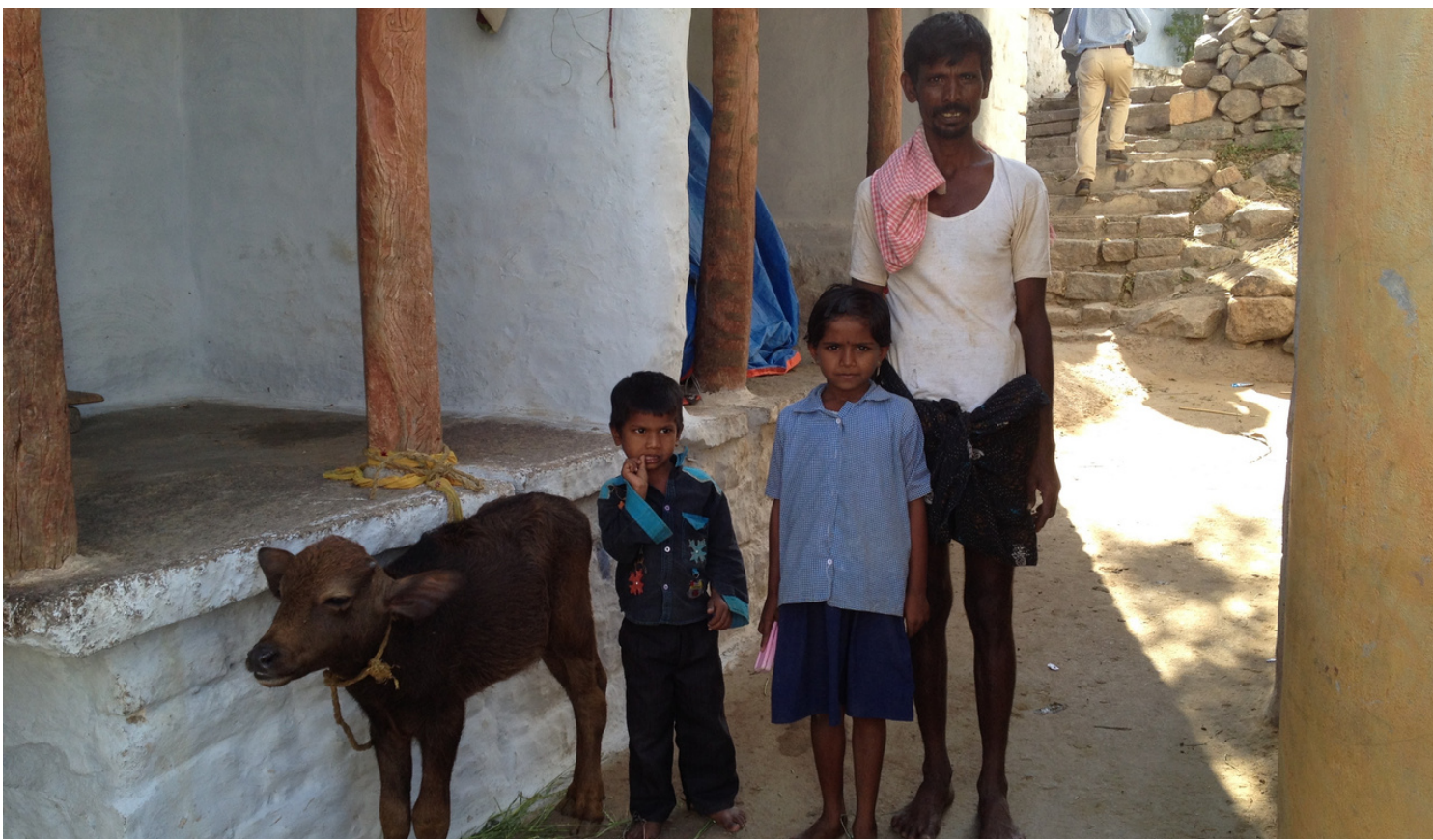
Photo: Halvi resident with his children

That means we still need £16,000 to complete Phase 1 of the office building project and to secure the future of the Halvi hostel plus £12,000 being 18 months running costs whilst we build them.