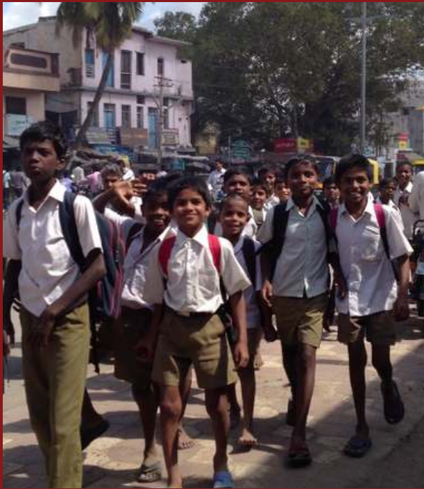
Photo: Bellary hostel boys returning from school

"The 2005 shop building project in Bellary means the Boy's home there is self-sufficient from the rents received..."