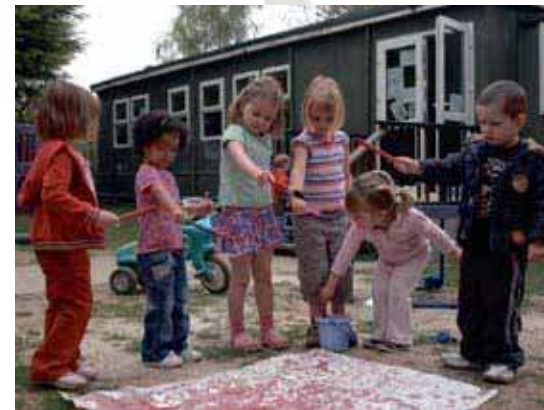
Children having fun splatter-painting outside the pre-school