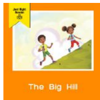
The Big Hill

More reading and writing fun at JustRightReader.com!