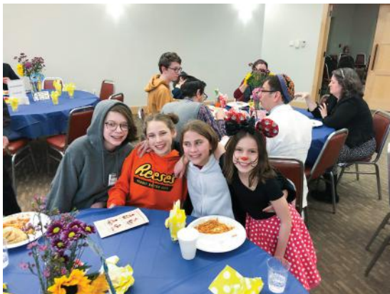
Purim Party at the shul