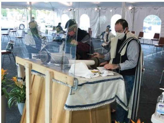
Morning Minyan in the tent