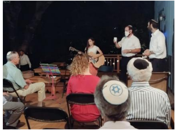
Kumzitz and Selichot at the rabbi's home