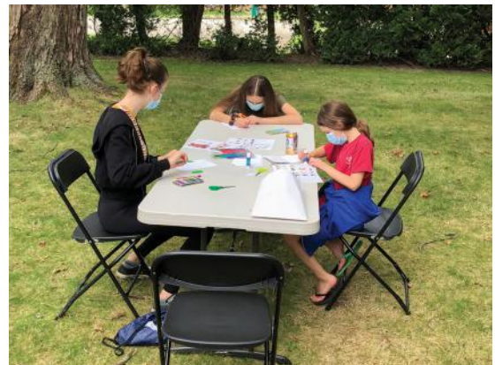
Card making for Shalach Manot packages for our senior members