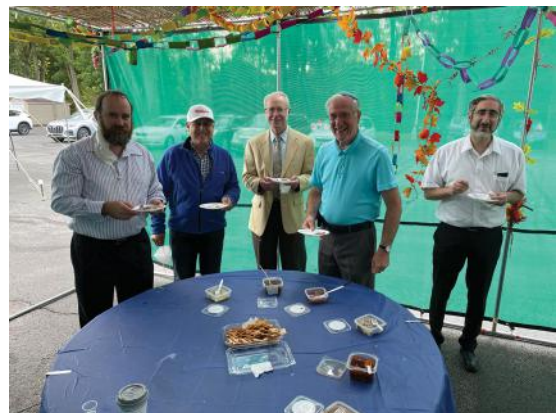
Gala Herring kiddush on Hoshana Rabba