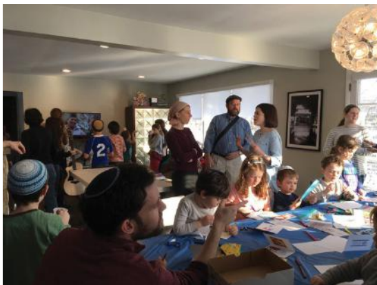
Making High Holiday cards for our senior members