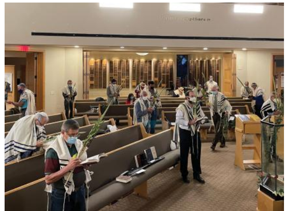
Hoshana Rabba davening at the shul