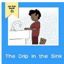
The Drip in the Sink