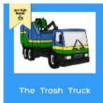
The Trash Truck

More reading and writing fun at JustRightReader.com!