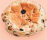
Walnut Raisin Cream Cheese Bun