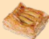
White Sauce Chicken Pie