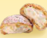
Osaka Cream Puff