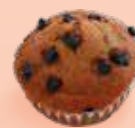
Banana Chocolate Chips Cake