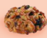
Mini Butterscotch Bread