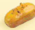
Passion Fruit Éclair