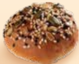
Mini Red Bean Whole Grains Bun