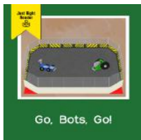
Go, Bots. Go!