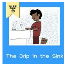
The Drip in the Sink