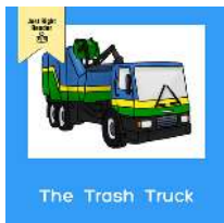
The Trash Truck