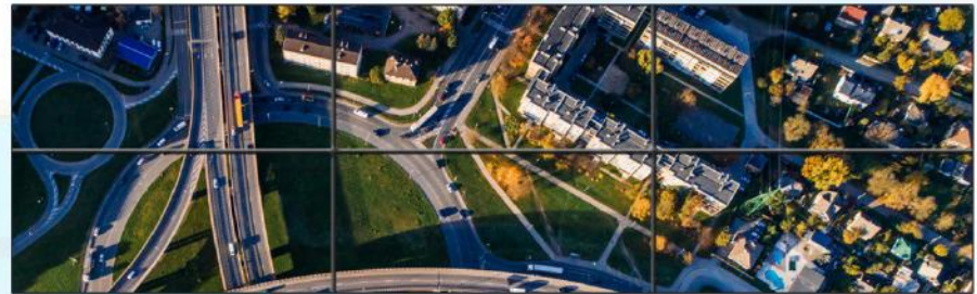
Seamless and slim design bezel of 3.5mm thickness