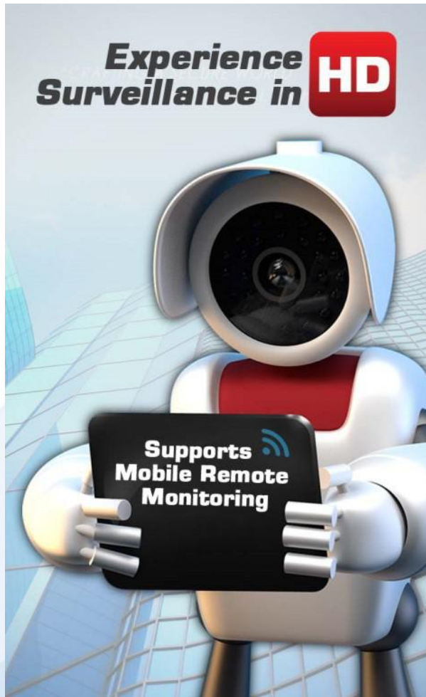
IP and Analog Cameras

One of the leading providers of a wide range and state-of-the-art Closed Circuit Television (CCTV) Systems in the Philippines. Rover System's major aim is to provide electronic security solutions to the Residential, Commercial and Industrial sectors.