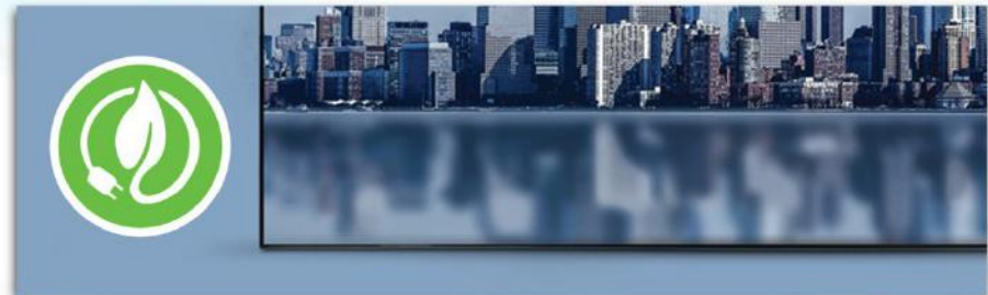
Low power consumption, instant response time and long life span of 60000 hours