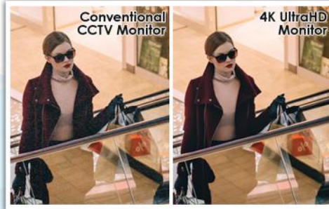
Adapt newest 3D Digital Filtering and 3D Digital Noise Reduction Technology to enhance display quality