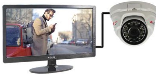
Supports Direct Connection to 4-in-1 CCTV camera