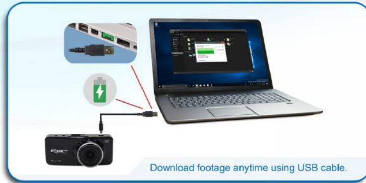
Download footage anytime using USB cable.