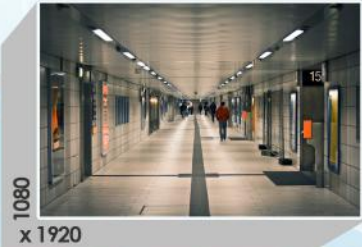
Full HD Resolution (1920x1080 pixels)