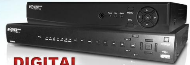
DIGITAL VIDEO RECORDER

SUGGESTED APPLICATION: Areas that do not need a very precise identification.