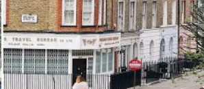
5MP 2560 X 1920