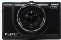
RMAA1002 available color in: Black ■ Silver □