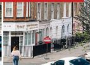
3MP 2048 X 1536