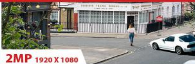
2MP 1920 X 1080

SUGGESTED APPLICATION: Areas that do not need a very precise identification.