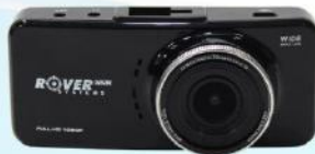
RMAAT602 available color in: Black ■ White □