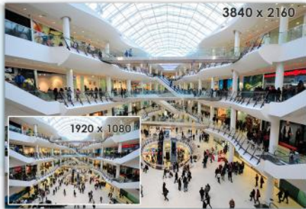
4K Ultra High Definition Resolution (3840 x 2160 pixels)