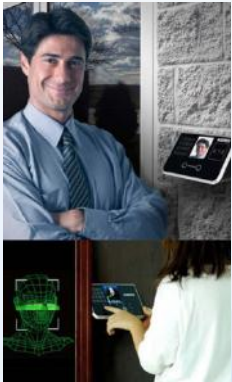
FACE200S Face + Prox Access Control 1000 Users