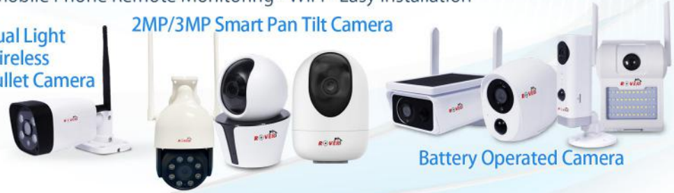
Battery Operated Camera