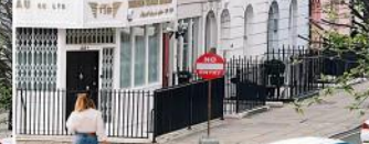
8MP 3840 X 2160

SUGGESTED APPLICATION: Areas that need a very precise identification.