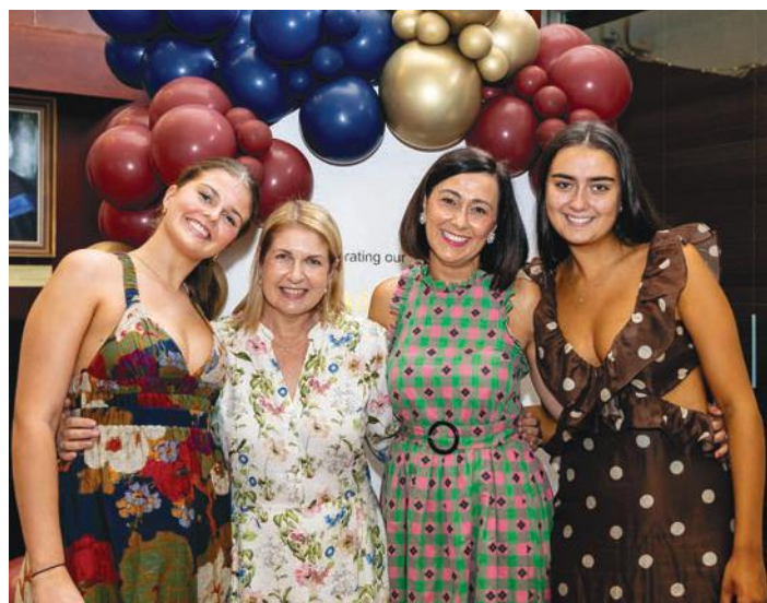
Above: Mothers and current students at Back to Women's.