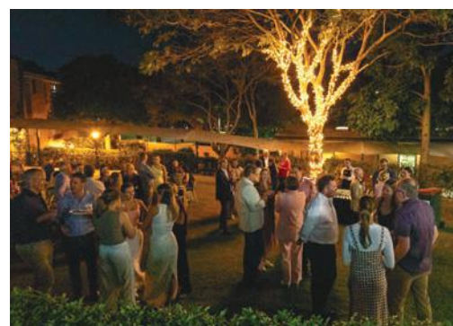
Above: The 2023 Father & Daughter Drinks event.

Mark your calendars and join us for a fun-filled family night on Friday 30 August. There will be food, entertainment and, of course, our exciting raffle! It's the perfect opportunity to enjoy quality time with your daughters while supporting a great cause. Invitations will be sent soon.