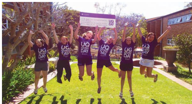
Above: A few of our 2023 UQ Giving Day Ambassadors.