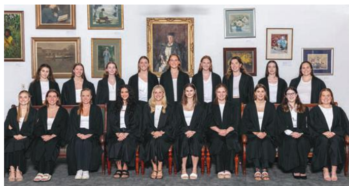
Academic Excellence and Other Prize recipients