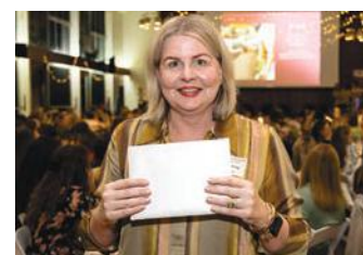
Above: Some of the winners of prizes from the Mother & Daughter Dinner. The Women's College thanks everyone who contributed to and participated in this major raffle.