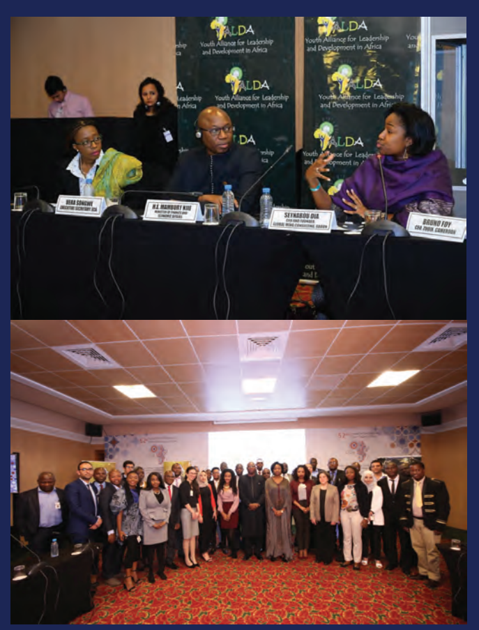
YALDA - UNECA Event attendees with Gambia Minister of Finance, H.E. Mambury Nije

· Advocated for stakeholder engagement in the implementation of the AfCFTA by UNECA and AU.