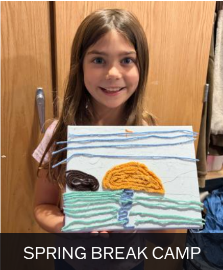
SPRING BREAK CAMP