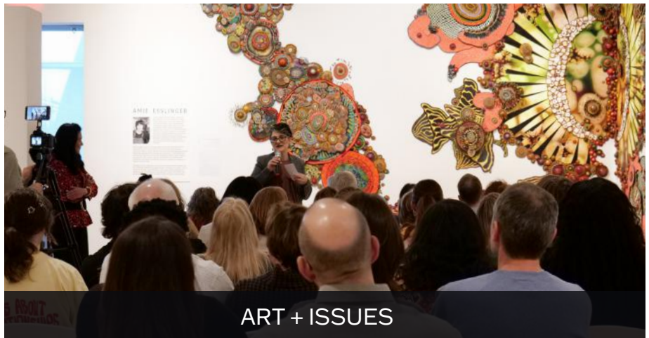
ART + ISSUES