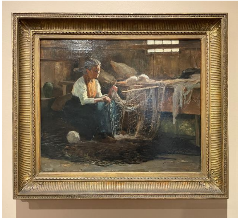
This rotation includes a new acquisition, Fisherman's Wife by Anna Wood Brown (1891), that reflects the Hunter's ongoing dedication to adding works by women artists to the permanent collection.

The paintings, primarily genre paintings portraying domestic family life and interactions among people from different backgrounds, offer a look at our newly established nation and share the trials, triumphs and simple joys of the diverse people who built it. The gallery also features more contemporary examples of genre scenes. In Jacob Lawrence's The 1920's... The Migrants Cast Their Ballots (from the Kent Bicentennial Portfolio: Spirit of Independence ) people of different ages and from different backgrounds (part of the Great Migration of Black Americans) are depicted exercising their right to vote.