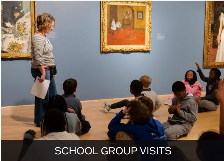
SCHOOL GROUP VISITS