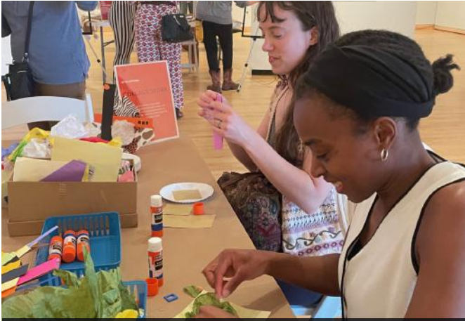
INTERACTIVE GALLERY EXPERIENCE