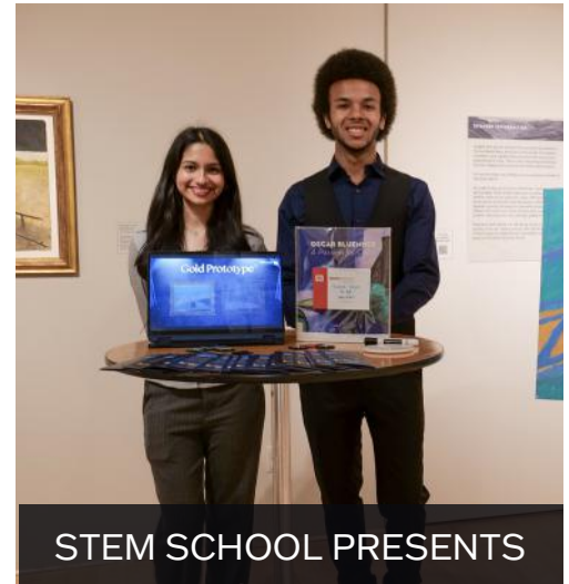
STEM SCHOOL PRESENTS