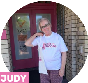
JUDY ENCORE PARTICIPANT

This is not just exercise. It is recovery, dignity, empowerment and a pathway back to living fully.