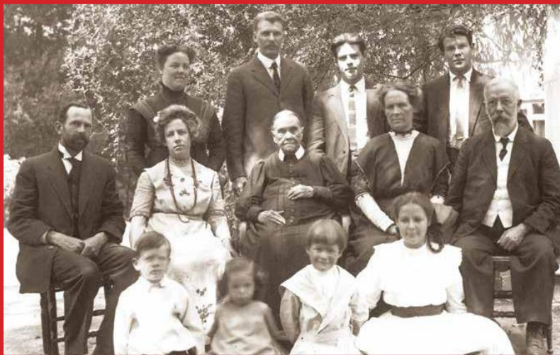
Ellen G. White (Seated in the middle) with her family at Elmshaven August 24, 1913