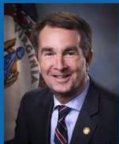
The Honorable Ralph Northam Governor Commonwealth of Virginia