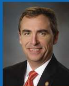
Stephen Brich Commissioner VDOT