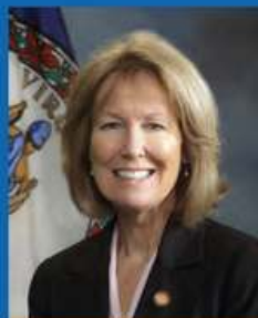
The Honorable Shannon Valentine Secretary of Transportation Commonwealth of Virginia