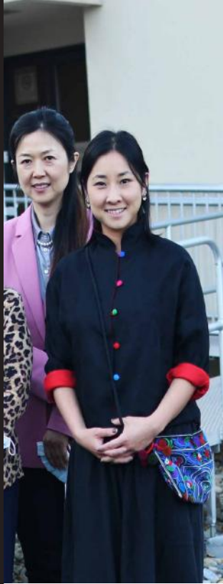
Boundaries in Health