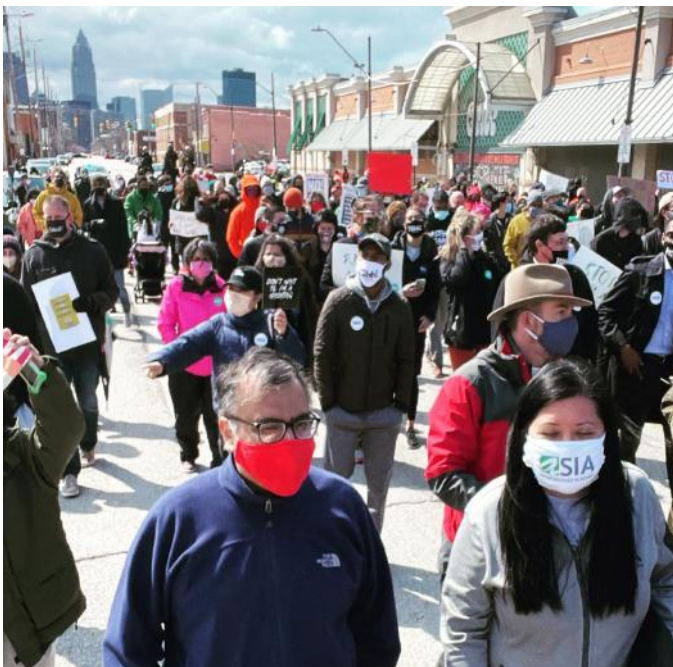
Hundreds of Northeast Ohioans of all backgrounds participating in the #StopAAPIHate rally held on March 28, 2021.

With the chaos and confusion created by the pandemic, ASIA's Community & Civic Engagement team was even more diligent ensuring the voices of our constituents were heard by local and national legislators. Heroic measures were taken so that members of the Asian American/Pacific Islander community were counted in the 2020 Census while equal efforts focused on voter education and registration for the 2020 Election. Our connection with the community never faltered during this time, and in fact, increased as we continuously provided critical information by trusted voices and in preferred languages.