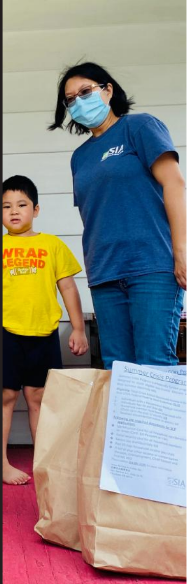
home goods were distributed to