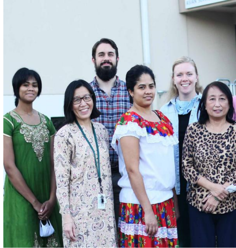
By completing coursework in the fall of 2020, participants of our Breaking program come one step closer to becoming certified medical interpreters

Despite the recent two-year COVID pandemic, ASIA continued to provide interpretation and translation services to 250 immigrants from across the globe. By embracing virtual technology and a streamlined workflow, 25 professionally trained interpreters and an expanded team of 110 others were able to safely and remotely support those in need with little or no interruption. While many took advantage of services provided virtually or over the phone, it was no surprise that the majority of our clients chose face-to-face sessions.