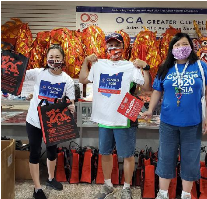
Joining forces with OCA Greater Cleveland in July 2020 to promote 2020 Census participation.