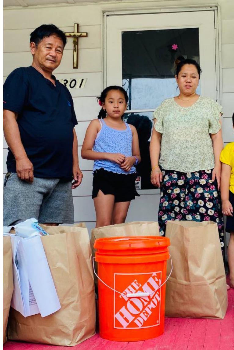
Making home deliveries. Over 10 tons of fresh produce and non-perishable 200 families throughout Akron and Cleveland in July of 2021.

Despite the various challenges COVID presented to service providers across Northeast Ohio, the Ahimsa department thrived. Because of the increase in victimization related to the pandemic, we experienced a drastic increase in client referrals. Our team worked corroboratively to develop a strategic plan outlining how to accept new cases and deliver the most trauma-informed services in COVID-safe environments. This past year tested our ability to handle some of the most difficult cases with far less resources than we were accustomed to. However, Ahimsa persevered for the betterment of the department, but most importantly, for the sake of our clients.