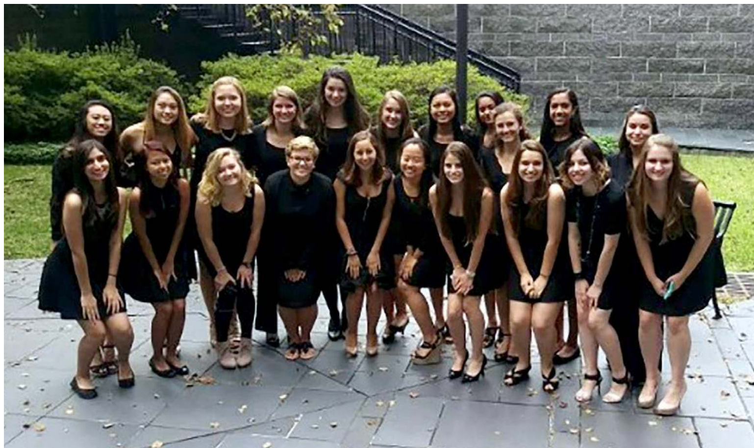
VCU Alpha and Beta Class at Beta Induction