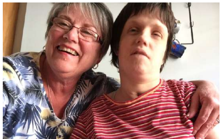
A selfie taken during a home visit five or six years ago.