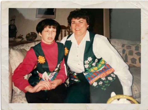
Wearing Easter vests.