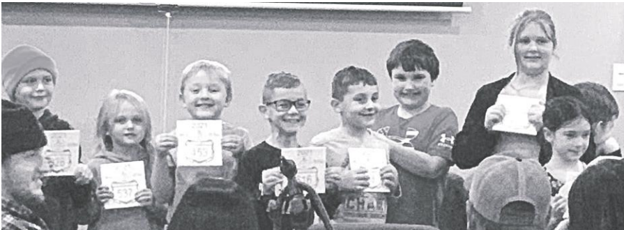
▲ Mini Jr awards