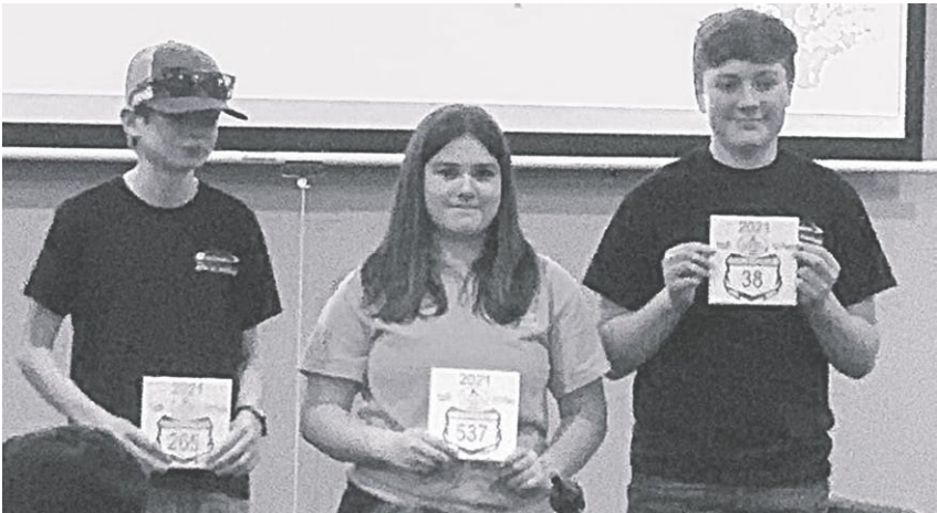
▲ Youth Class awards