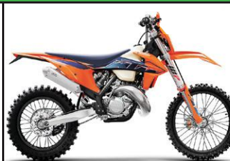
2022 KTM 150 XC-W TPI