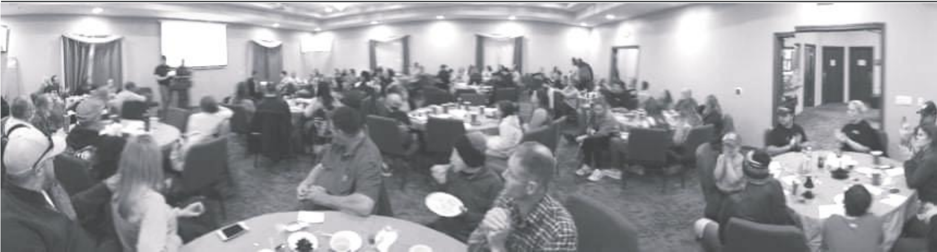
▲ 2021 Banquet crowd