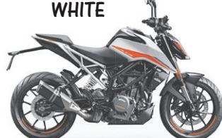
2021 KTM 390 DUKE