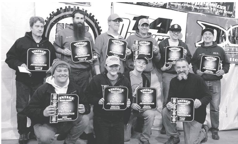
▲ Ten racers earned the Perfect Attendance Award