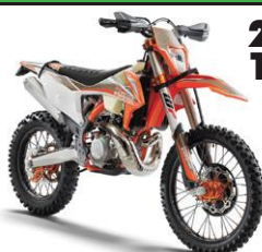
2022 KTM 300 XC-W TPI ERZBERGRODEO