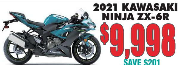
2021 KAWASAKI NINJA ZX-6R