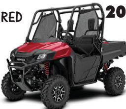
2021 HONDA PIONEER 700 DELUXE

Get cash for your used powersports vehicles!