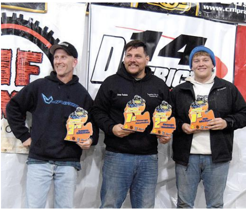
▲ Transition GP top three and 125 Champ