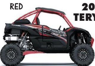
2021 KAWASAKI TERYX KRX 1000 ES