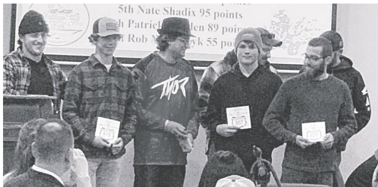
▲ C Class awards