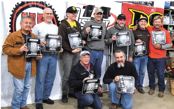
▲ Evolution top ten