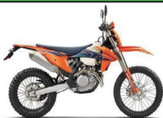
2022 KTM 500 EXC-F