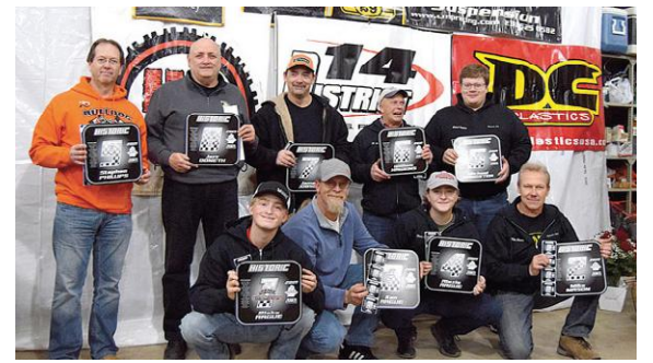
▲ Historic top nine