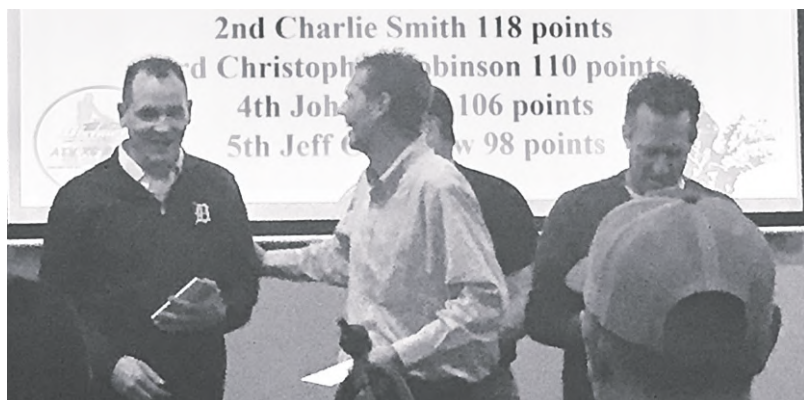
▲ O Class awards