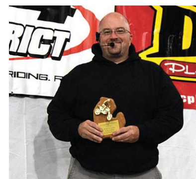
▲ The 65/70+ racers gave an award to thank us for getting a class for them