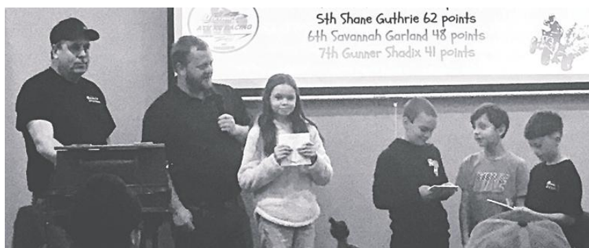
▲ Mini Sr awards