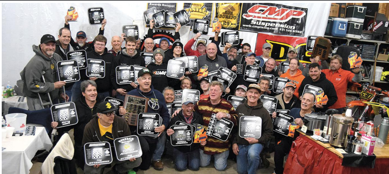
▲ The award winning race group continues to grow