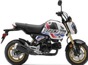
2022 HONDA GROM