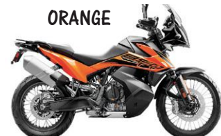
2021 KTM 890 ADVENTURE