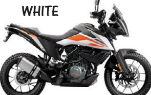
2021 KTM 390 ADVENTURE