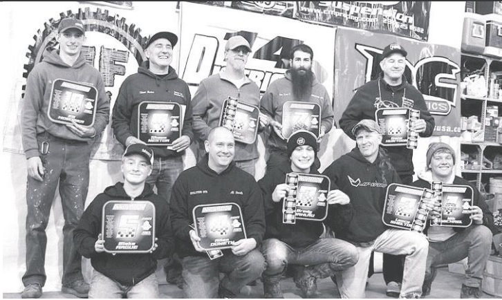
▲ Innovation top ten