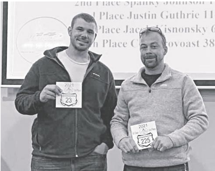
▲ B Class awards