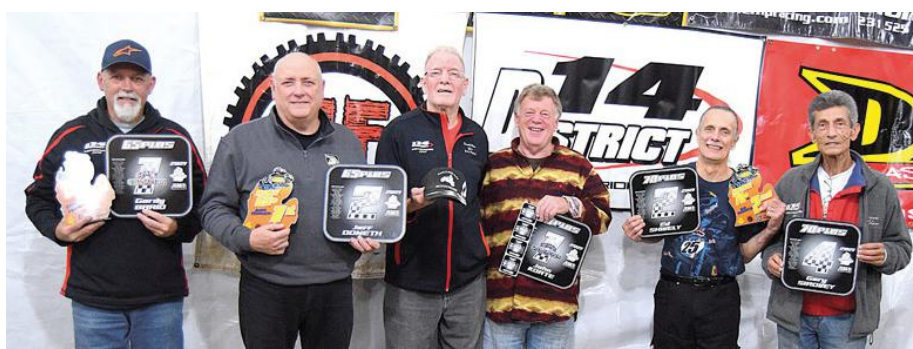
▲ This year was the first year for a 65 and 70+ class