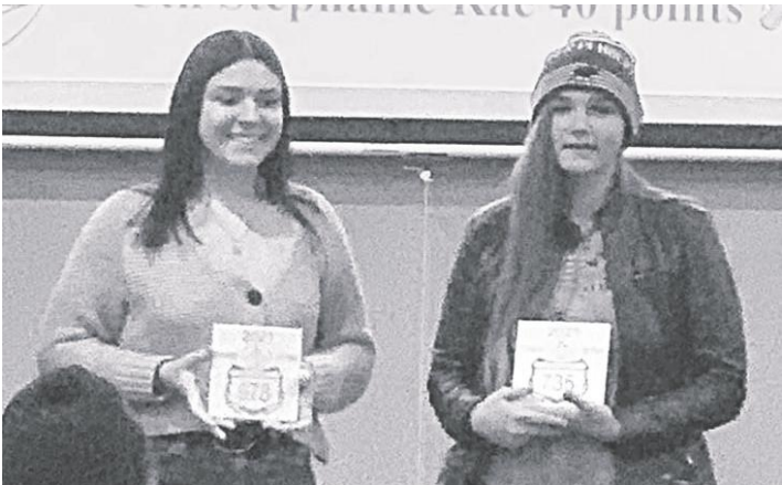
▲ Women's Class awards