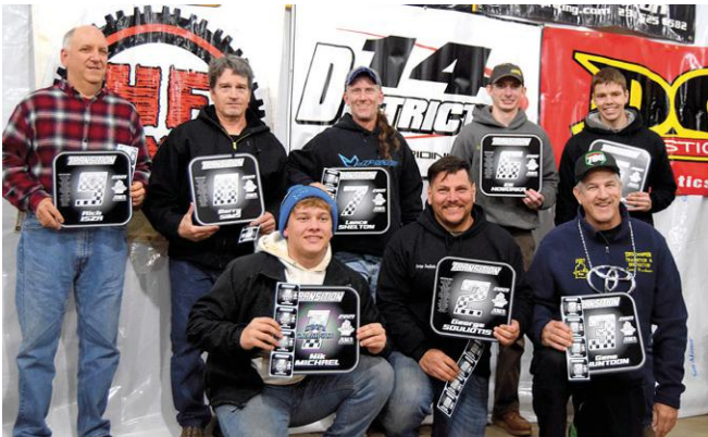
▲ Transition Top Ten