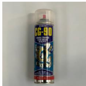
CG -90 Clear Grease