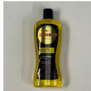
SIMONIZ Shampoo & Wax