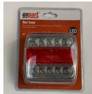
LED Tail Lamp