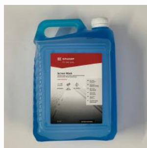
Screenwash Concentrate 5L