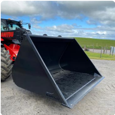
Manitou Bucket 2000L