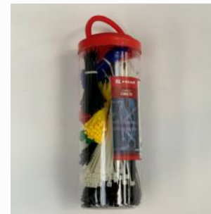
Pack of 1000 Cable Ties