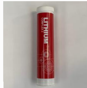
Red Grease Cartridges