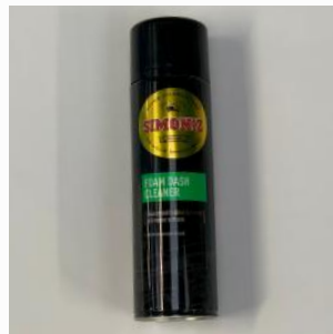
SIMONIZ Foam Dash Cleaener