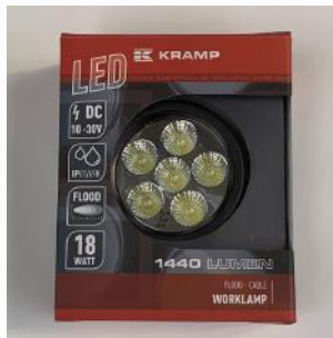
LED Work Lamp