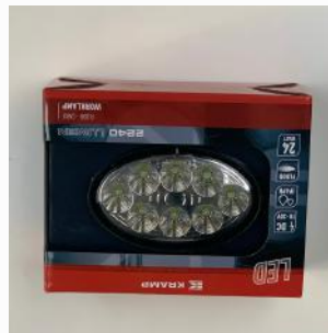
LED Work Lamp LA10058