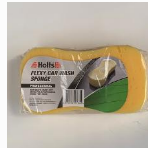
Jumbo Sponge KCC1928