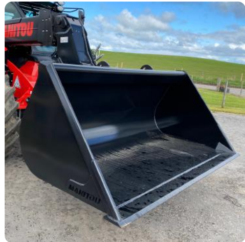
Manitou Bucket 1500L