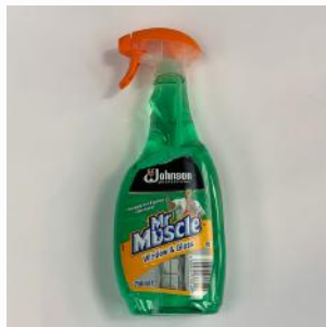
Mr Muscle Platinum Windows & Glass