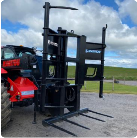
Manitou Universal Bale Grab