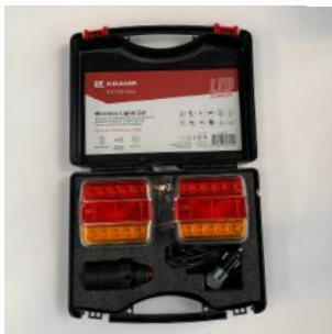
Wireless Light Set