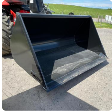
Manitou Bucket 3000L