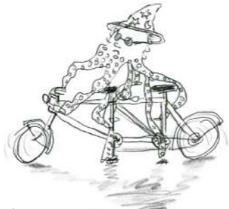
octopus riding tandem