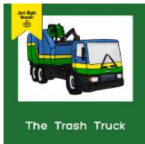
The Trash Truck