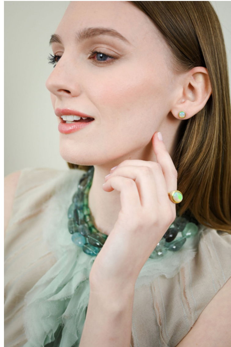
Opal and aquamarine statement rings complement a blue-green beryl nugget necklace and opal studs.