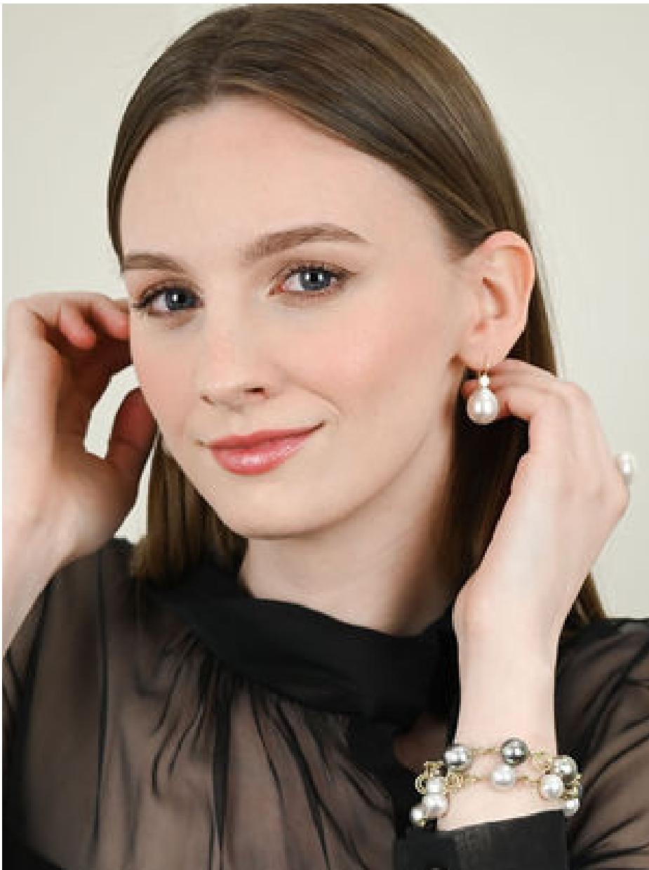
Black Tahitian & South Sea pearl perfection