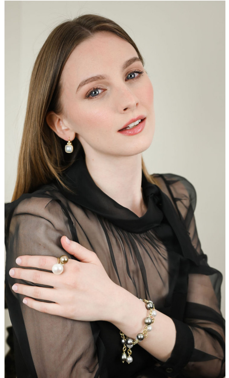
Timeless pearls: Mabes, South Sea, Black Tahitian & Freshwater