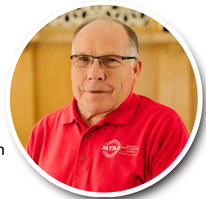
Jerry Merrill, Mayor