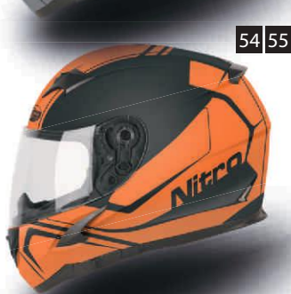
54 | 55