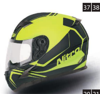
37 | 38