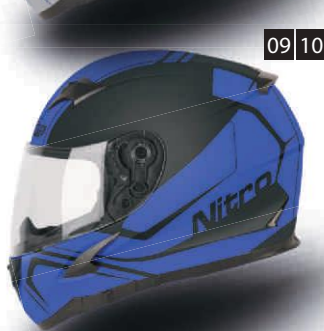
09 | 10