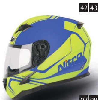
42 | 43