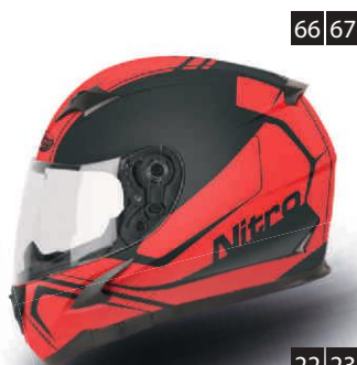
66 | 67