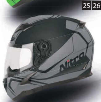
25 | 26