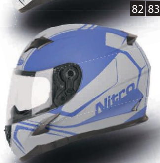
82 | 83