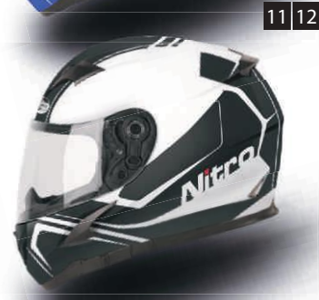
11 | 12