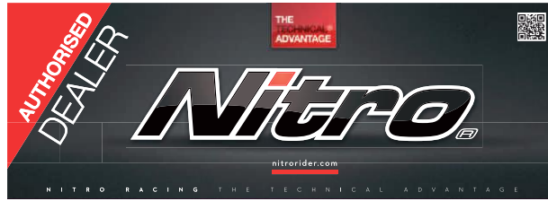
NITRO WINDOW STICKER 25cm x 9cm dealer window sticker ARTICLE NO. 999368