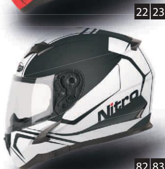
22 | 23