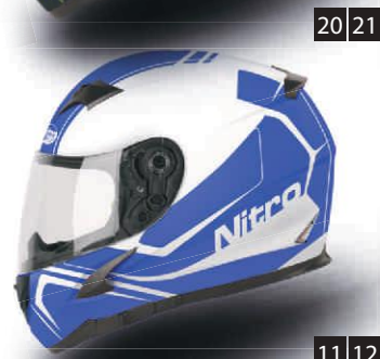
20 | 21