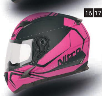
16 | 17