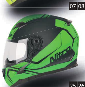
07 | 08