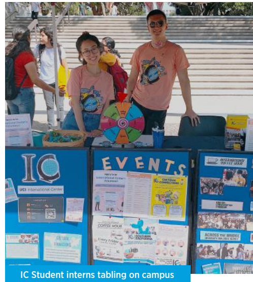
IC Student interns tabling on campus