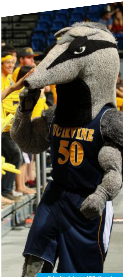
Peter the Anteater, UCI's Mascot

Rainy season in Southern California runs from December to March.