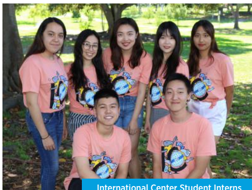
International Center Student Interns