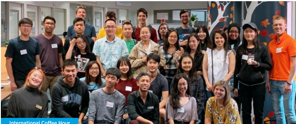
International Coffee Hour

Information for new students is available on the website and provides specific information for new students, including TB Screening and Immunization Requirements and Health Insurance Requirements shc.uci.edu/new-student-information .