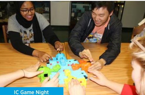
IC Game Night

THE UCI INTERNATIONAL CENTER IS YOUR ONLY SOURCE FOR VISA INFORMATION.