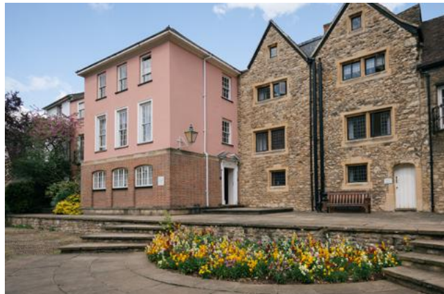
North Quad first-year accommodation, Main Site