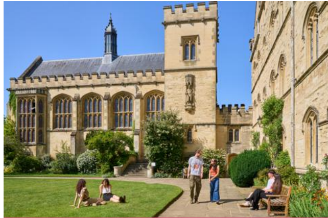
Chapel Quad, Main Site

A short walk along the river will take you to our Sir Geoffrey Arthur Building (GAB) accommodation annexe, where many of our students choose to live in later years. A little further down the road is our sportsground and orchard, 'Pembfields', sitting among open fields and meadows.