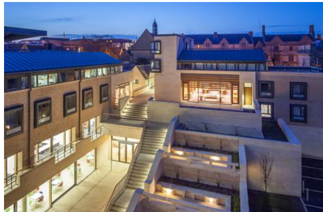
Rokos Quad, Main Site