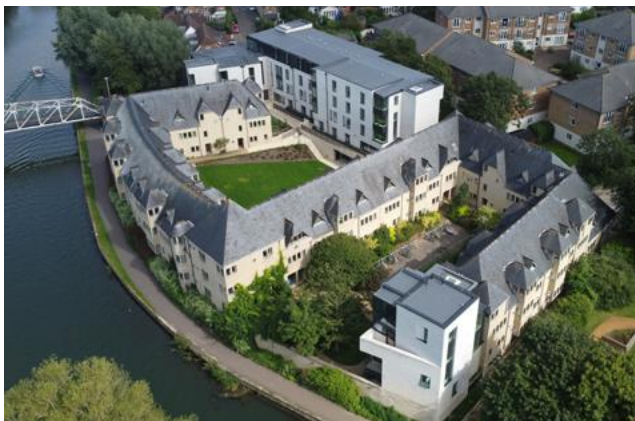
The GAB accommodation annexe