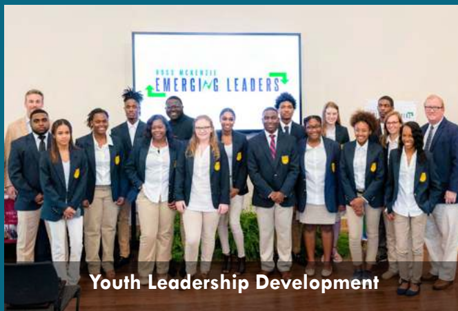
Youth Leadership Development

Advanced learning and seasoned facilitators combine, creating forward momentum in education and training for this region. Our school districts serve 20,000 students in 38 public schools and nearly 2,000 students in 13 private schools. This region is home to seven colleges and universities: The University of South Carolina-Sumter, Central Carolina Technical College, Morris College, Troy University, Embry-Riddle Aeronautical University, Saint Leo University, and Webster University.