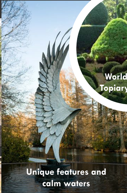
Unique features and calm waters