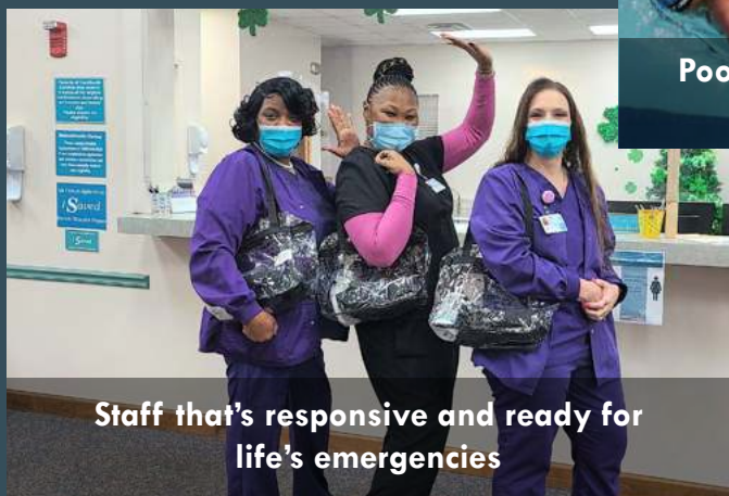
Staff that's responsive and ready for life's emergencies