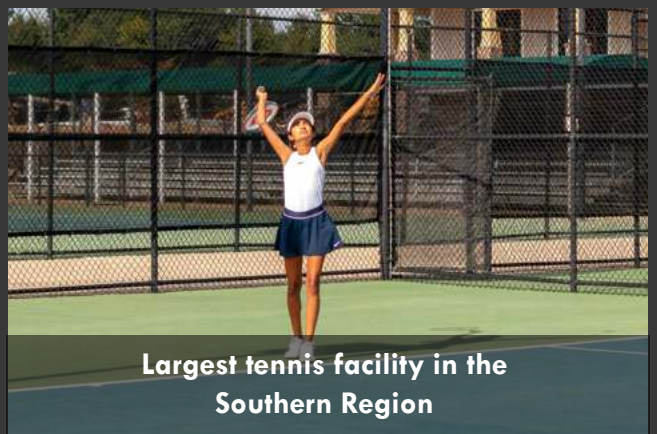
Largest tennis facility in the Southern Region