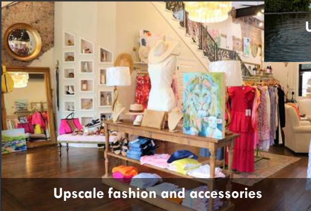
Upscale fashion and accessories