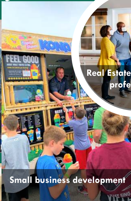
Small business development