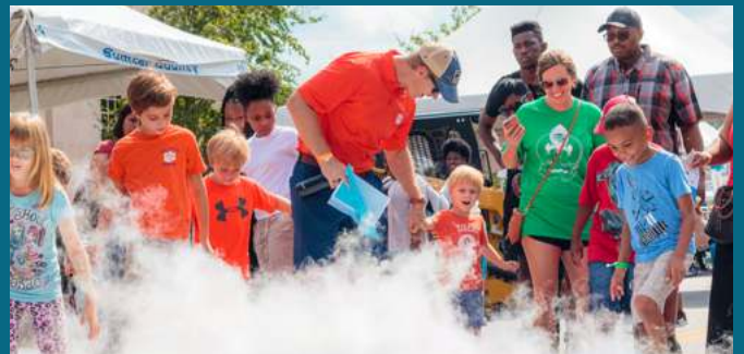
STEAM adventures for kids and adults of all ages