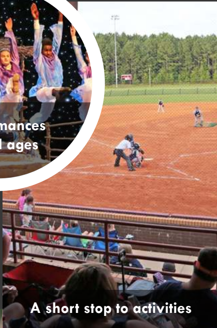
A short stop to activities