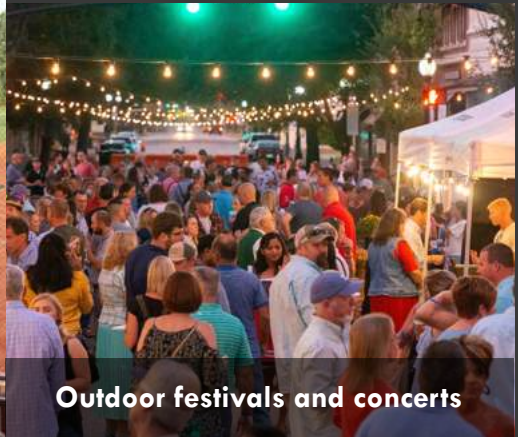
Outdoor festivals and concerts