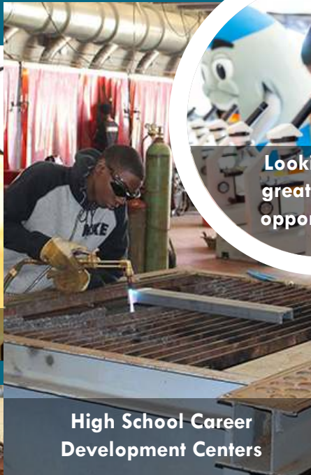
High School Career Development Centers