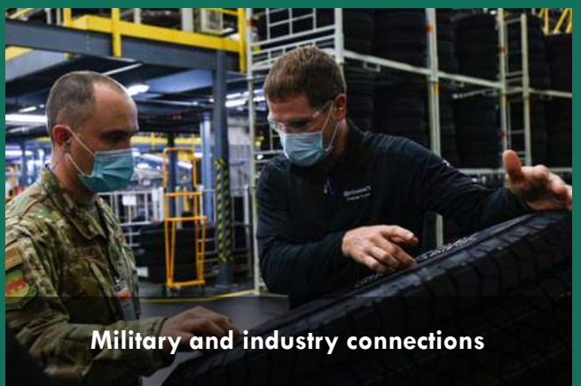
Military and industry connections