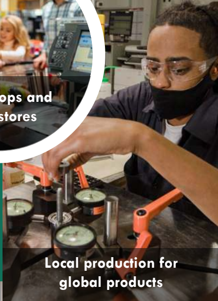
Local production for global products