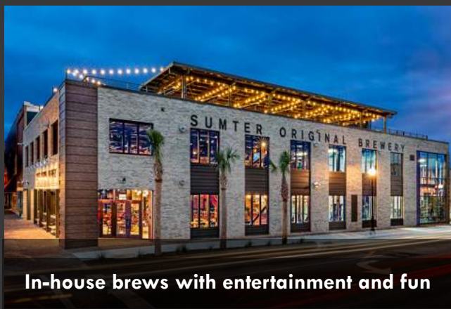
In-house brews with entertainment and fun

Our region has cozy spots for rest and an inviting ambiance. Food bursting with flavor from local restaurants, and entertainment you'll enjoy in a community you'll love. Families enjoy disc golf, tennis courts, jogging trails, playgrounds, softball, baseball and soccer at several state-of-the-art recreational facilities. We're home to a growing arts and culture scene, including Sumter's Historic Opera House which boasts a 550-seat theatre, excellent acoustics and the perfect intimate venue to see your favorite artists.