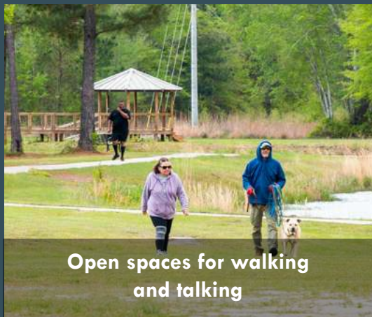
Open spaces for walking and talking