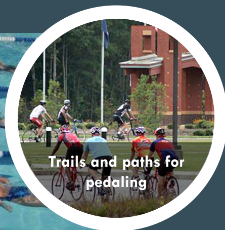
Trails and paths for pedaling