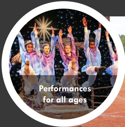
Performances for all ages