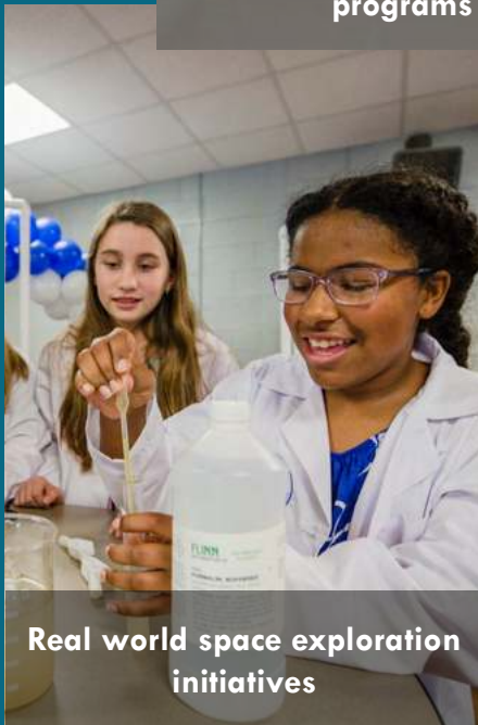
Real world space exploration initiatives