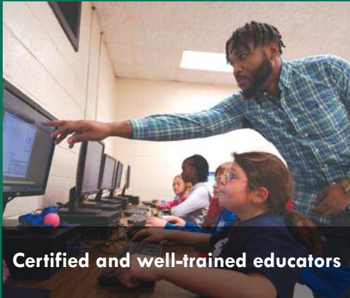
Certified and well-trained educators