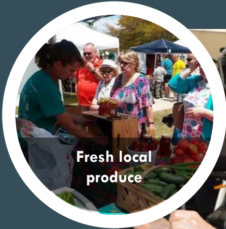
Fresh local produce