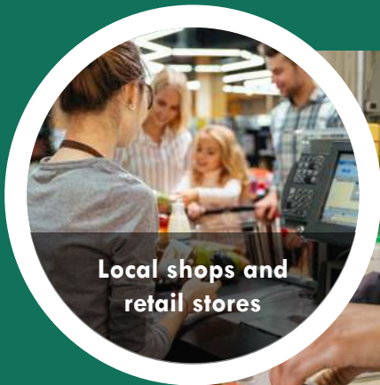
Local shops and retail stores