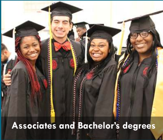
Associates and Bachelor's degrees