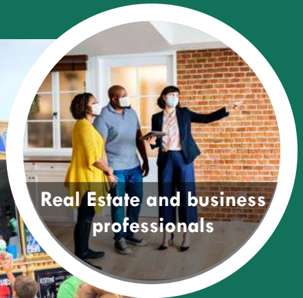
Real Estate and business professionals