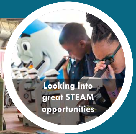
Looking into great STEAM opportunities