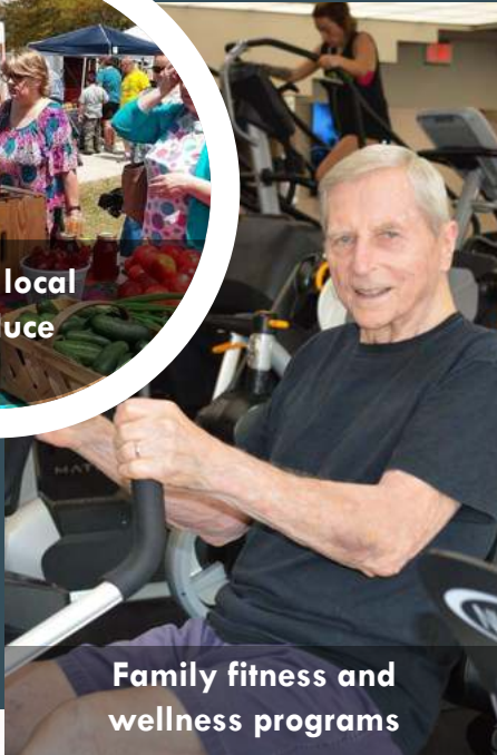
Family fitness and wellness programs