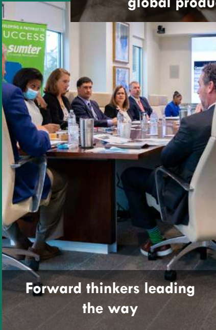
Forward thinkers leading the way