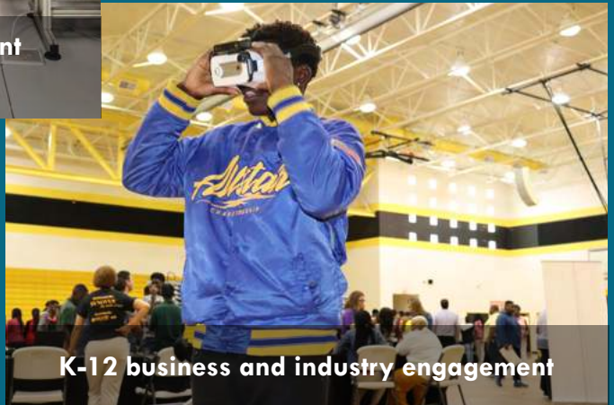
K-12 business and industry engagement