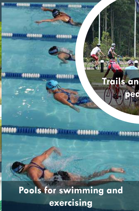
Pools for swimming and exercising