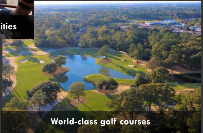
World-class golf courses