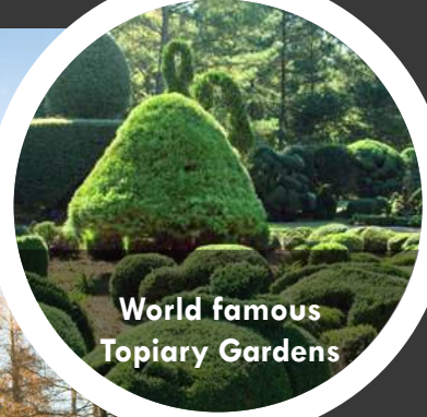
World famous Topiary Gardens