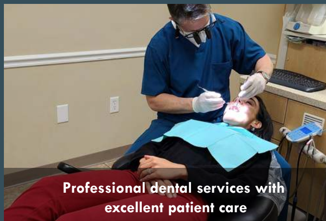
Professional dental services with excellent patient care

Now more than ever, healthcare has taken center stage as we rapidly increase our access to healthcare advances. Our facilities feature modern technologies enhanced by a caring and qualified staff, bringing the best and most updated healthcare treatment to TheLINK region.