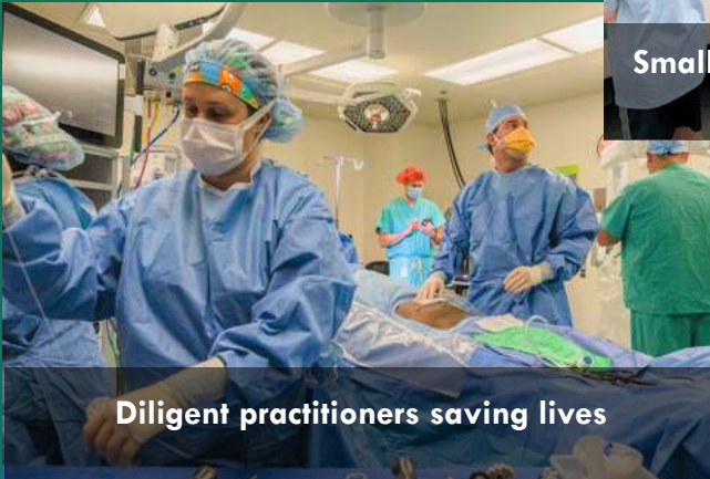
Diligent practitioners saving lives