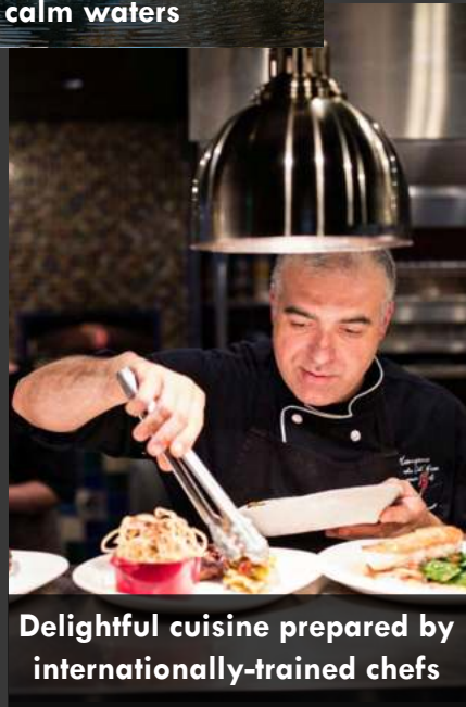
Delightful cuisine prepared by internationally-trained chefs