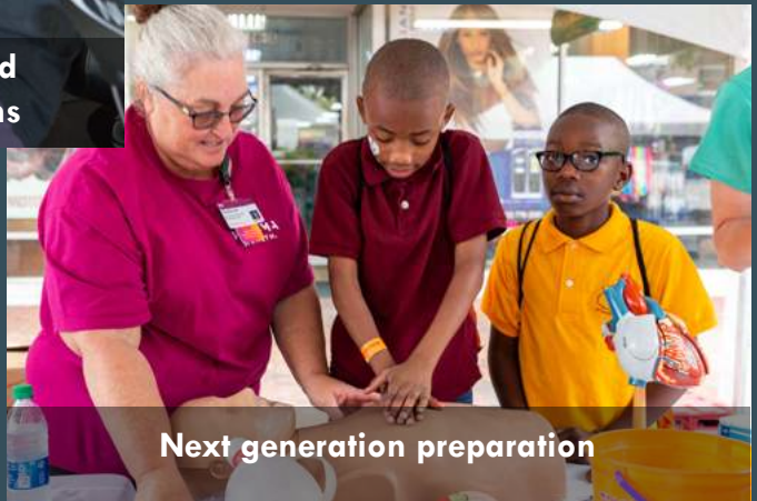
Next generation preparation