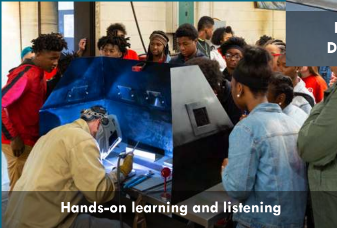
Hands-on learning and listening