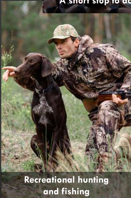
Recreational hunting and fishing