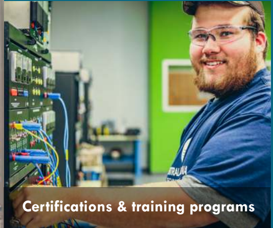
Certifications & training programs