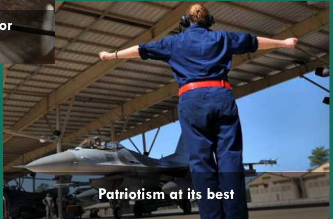
Patriotism at its best