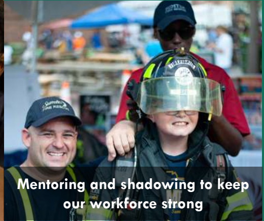
Mentoring and shadowing to keep our workforce strong