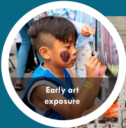
Early art exposure