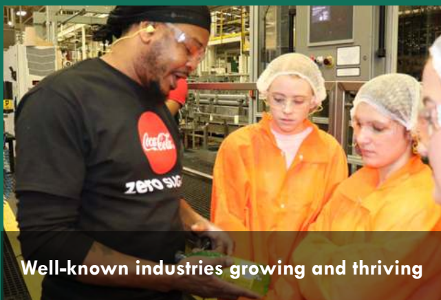
Well-known industries growing and thriving