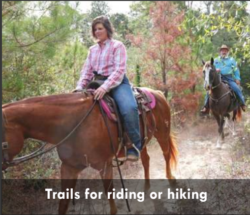
Trails for riding or hiking