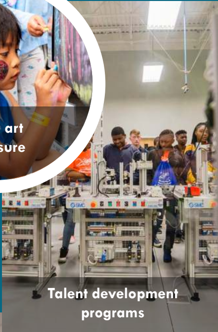
Talent development programs