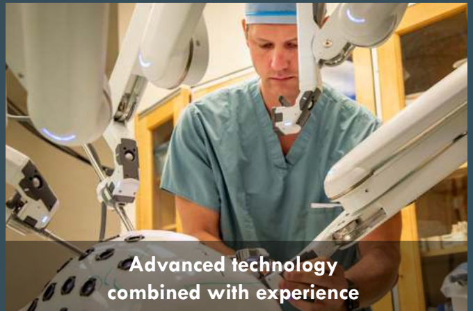
Advanced technology combined with experience