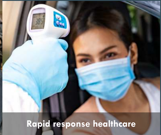
Rapid response healthcare