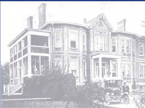
Alexander Hospital 1913