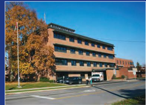
Lakeridge Health Bowmanville 2021