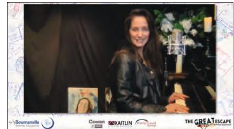
Chantal Kreviazuk, Canadian singer-songwriter