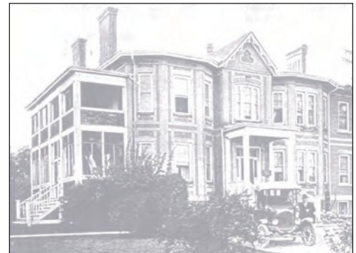
Alexander Hospital - 1913