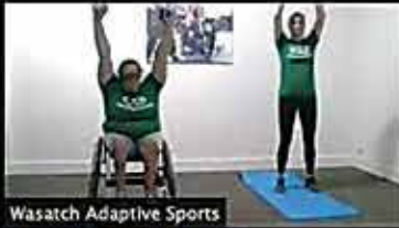
Wasatch Adaptive Sports