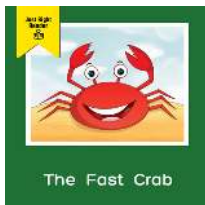
The Fast Crab