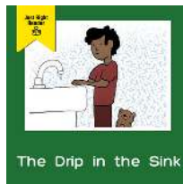
The Drip in the Sink

More reading and writing fun at JustRightReader.com!