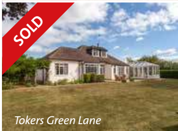
Tokers Green Lane