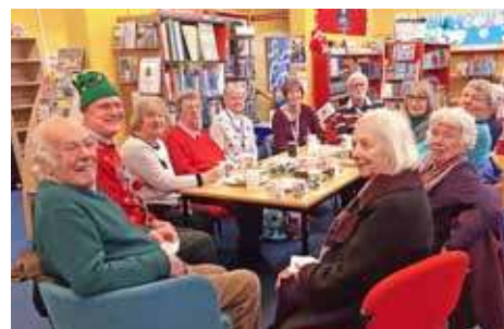
Digital Helper Volunteers and learners enjoying a Christmas treat

Saturday mornings: we have storytimes at 10am every Saturday, and there will be a 'special' storytime with crafts and home-made cakes for sale on 21 March (to celebrate Mothering Sunday next day)