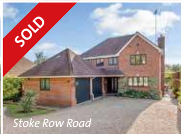
Stoke Row Road