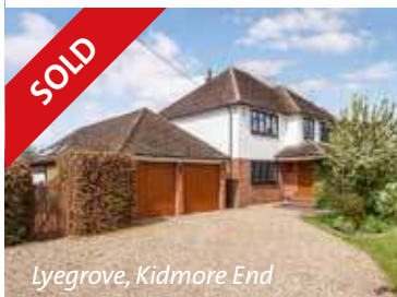
Lyegrove, Kidmore End