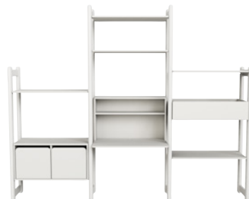
Item no: 81-26714-40 H:189,2 L:232 W:47