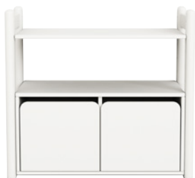
Item no: 81-26402-40 H:74 L:80 W:34,8