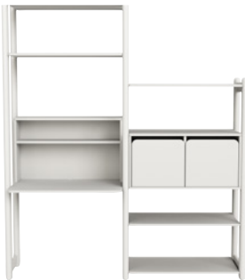
Item no: 81-26713-40 H:189,2 L:156 W:47