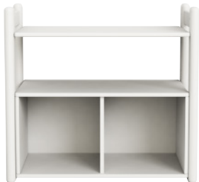
Item no: 81-26203-40 H:74 L:80 W:34,8