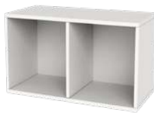
Item no: 81-26202-40 H:34,5 W:72 D:34,5