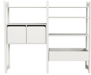
Item no: 81-26506-40 H:131,6 L:156 W:34,8