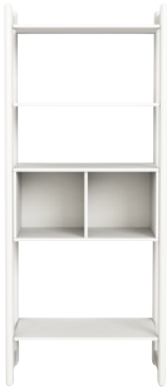
Item no: 81-26504-49 H:189,2 L:80 W:34,8