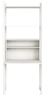
Item no: 81-26711-40 H:189,2 L:80 W:47