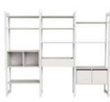
Item no: 81-26509-40 H:189,2 L:232 W:34,8