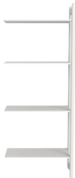
Item no: 81-26712-40 H:189,2 L:76 W:34,8