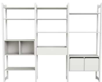
Item no: 81-26509-40 H:189,2 L:232 W:34,8