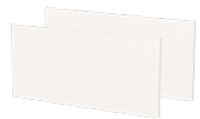
Item no: 81-26602-40 H:1,6 W:72 D:34,5