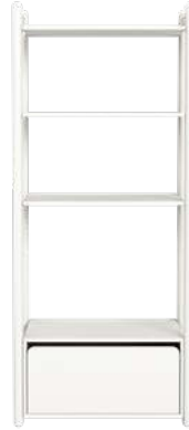
Item no: 81-26304-40 H:189,2 L:80 W:34,8