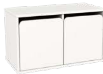
Item no: 81-26401-40 H:34,5 W:72 D:34,5