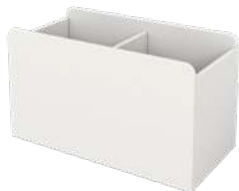
Item no: 81-26708-40 H:34,7 W:71 D:34,5