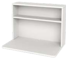
Item no: 81-26701-40 H:46,5 W:72 D:46,8