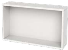
Item no: 81-26201-40 H:17,6 W:72 D:34,5