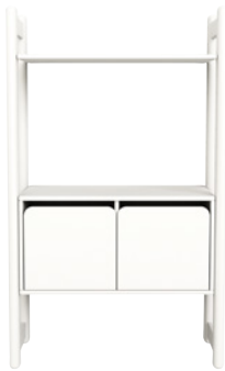
Item no: 81-26502-40 H:131,6 L:80 W:34,8