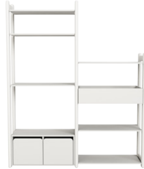
Item no: 81-26507-40 H:189,2 L:156 W:34,8