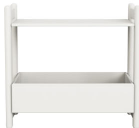
Item no: 81-26204-40 H:74 L:80 W:34,8