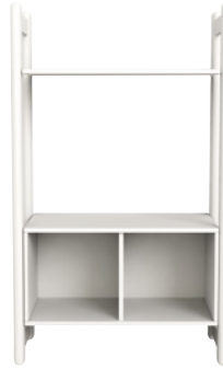
Item no: 81-26501-40 H:131,6 L:80 W:34,8