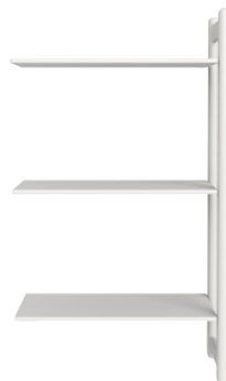
Item no: 81-26710-40 H:131,6 L:76 W:34,8