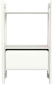
Item no: 81-26303-40 H:131,6 L:80 W:34,8