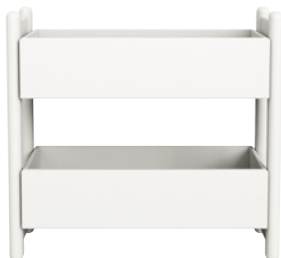
Item no: 81-26205-40 H:74 L:80 W:34,8