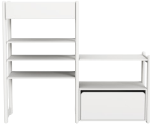
Item no: 81-26305-40 H:131,6 L:156 W:34,8