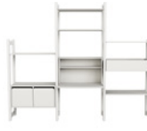
Item no: 81-26714-40 H:189,2 L:232 W:47

See more about SHELFIE on flexaworld.com