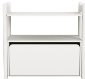
Item no: 81-26302-40 H:74 L:80 W:34,8