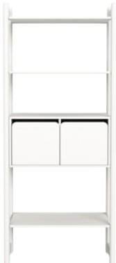
Item no: 81-26505-40 H:189,2 L:80 W:34,8