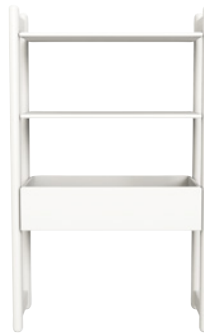
Item no: 81-26503-40 H:131,6 L:80 W:34,8