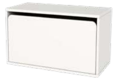
Item no: 81-26301-40 H:34,5 W:72 D:34,5