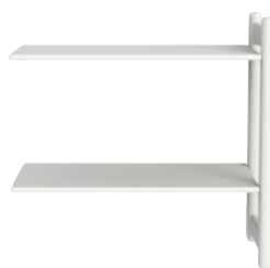
Item no: 81-26709-40 H:74 L:76 W:34,8