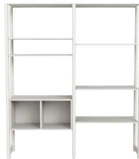
Item no: 81-26508-40 H:189,2 L:156 W:34,8