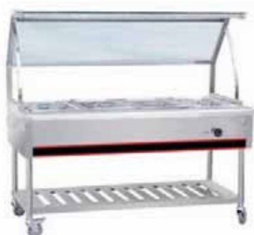
MOBILE BAIN MARIE WITH HOOD