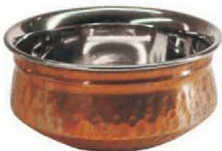
HANDI COPPER BOTTOM