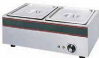
TABLE TOP ELECTRIC BAIN MARIE

Also available with tray slide and sneeze guard.