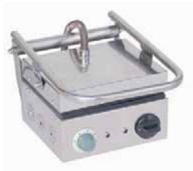
SANDWICH GRILLER SINGLE