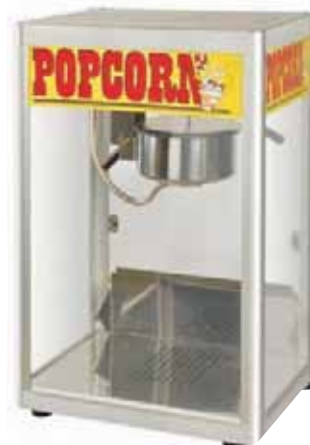
POP CORN MACHINE