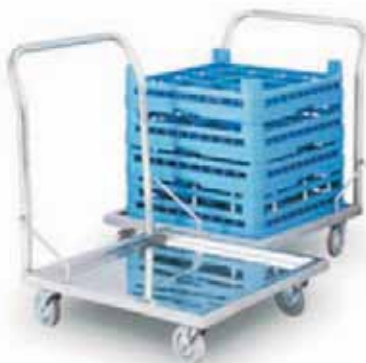
DISH COLLECTION TROLLEY