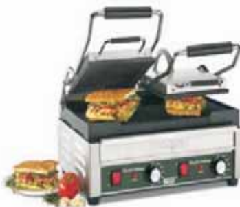
SANDWICH GRILLER DOUBLE

Complete stainless steel with mirror finish body and adjustable griller plate at suitable pressure through spring tension device.