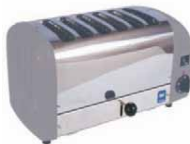
POP UP TOASTER

Complete stainless steel with mirror finish body and adjustable griller plate at suitable pressure through spring tension device.