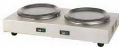
COFFEE WARMER PLATE