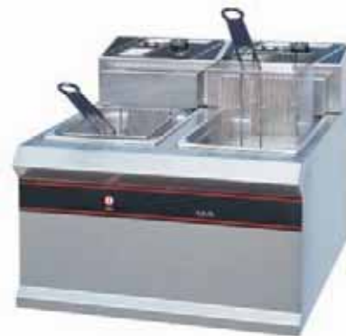
DEEP FRYER DOUBLE

CAP-10 LTRS. 208-240 volt, 3800 watts, SIZE: 24.6" x 17.5" x 15.7