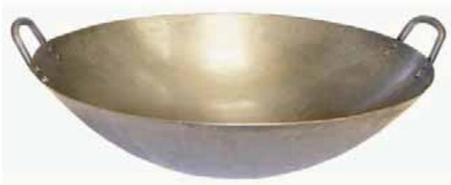
CHINESE WOK DOUBLE HANDLE