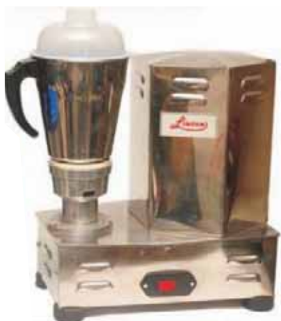
HEAVY DUTY MIXER