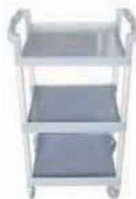
BUSSING TROLLEY 3 SHELF

Constructed for easy loading and safe mobility. It's a boon for transfer and handling of food.