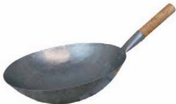
CHINESE WOK SINGLE HANDLE