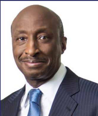
Ken Frazier Executive Chairman Merck