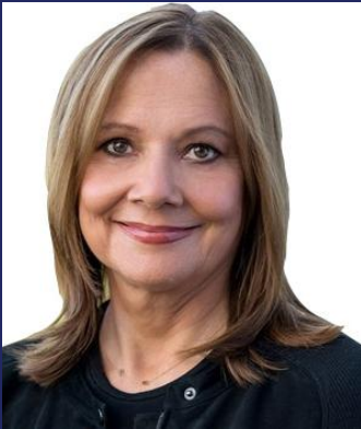
Mary Barra Chair & CEO General Motors