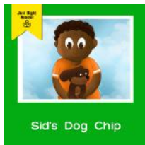
Sid's Dog Chip