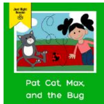
Pat Cat, Max, and the Bug

More reading and writing fun at JustRightReader.com!