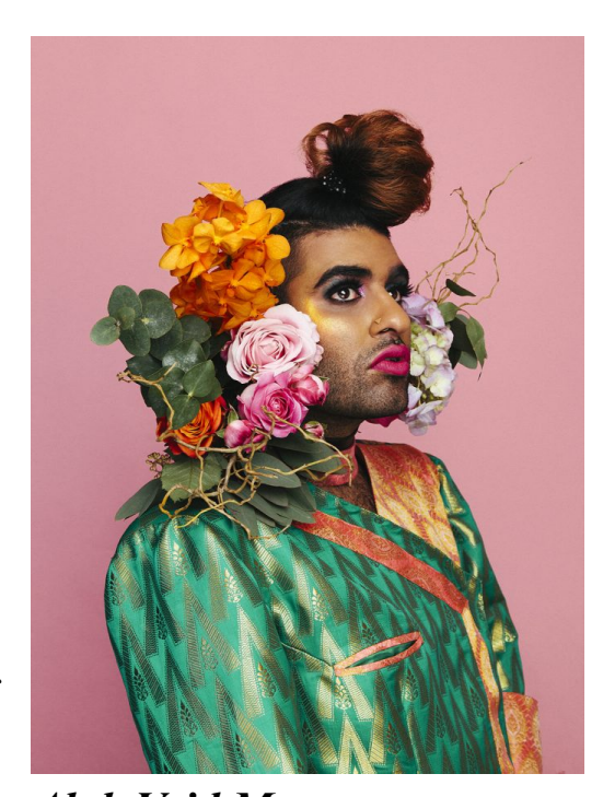
Alok Vaid Menon

We should treat everyone equally and not discriminate against people based on their choice of dressing or gender. Instead of backlashing ideas that do not fit our daily sections, let us try to welcome and even celebrate the changes. I know that it will not be easy but, slowly, we can be part of the marvellous new changes.