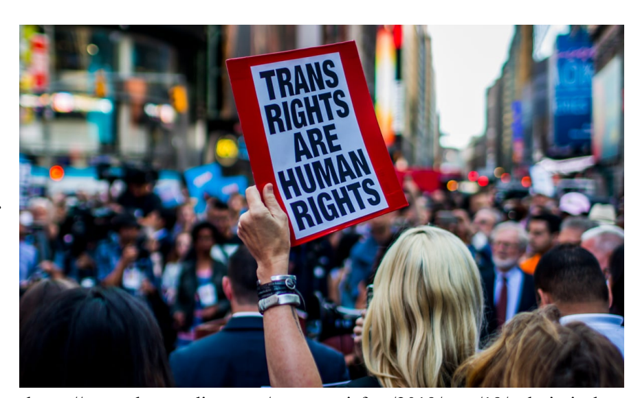
https://www.theguardian.com/comment is free/2019/may/19/valerie-jackson-trans-women-misogyny-feminism

I know that it might get a lot to absorb but gender and sexuality are whole different spectrums, none of which are simple enough to be put into the norm boxes. To make it simpler for everyone, let us see people as humans with