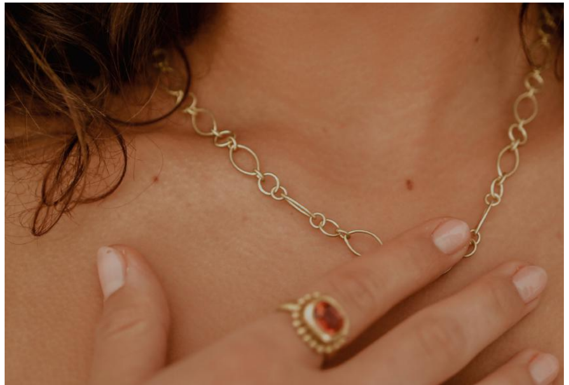
18k gold mini marquise link chain