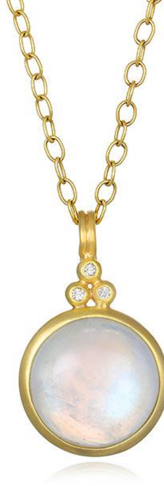
18k gold rainbow moonstone and diamond pendant on handmade chain