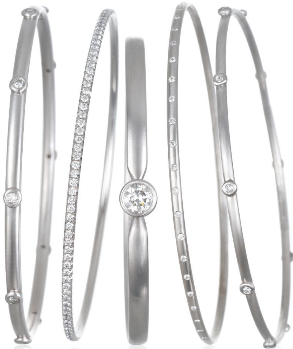
platinum diamond bangles