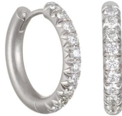
platinum diamond micro pave huggy hoops