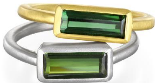
18k gold green tourmaline rings