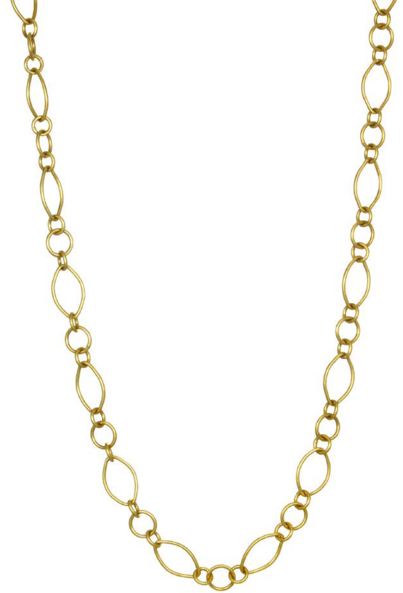
18k gold handmade mini marquise link and paper clip chains