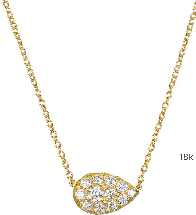
18k gold pear shape diamond micro pave necklace