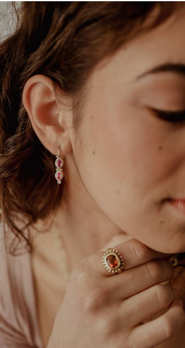
18k gold purple-pink sapphire and diamond earrings