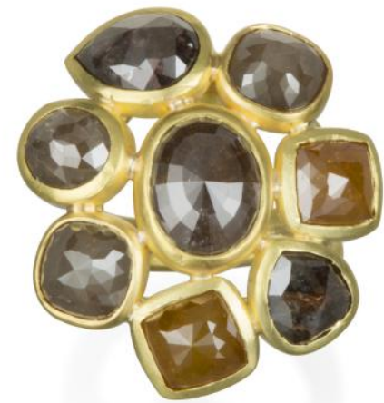
18k gold milky diamond daisy ring