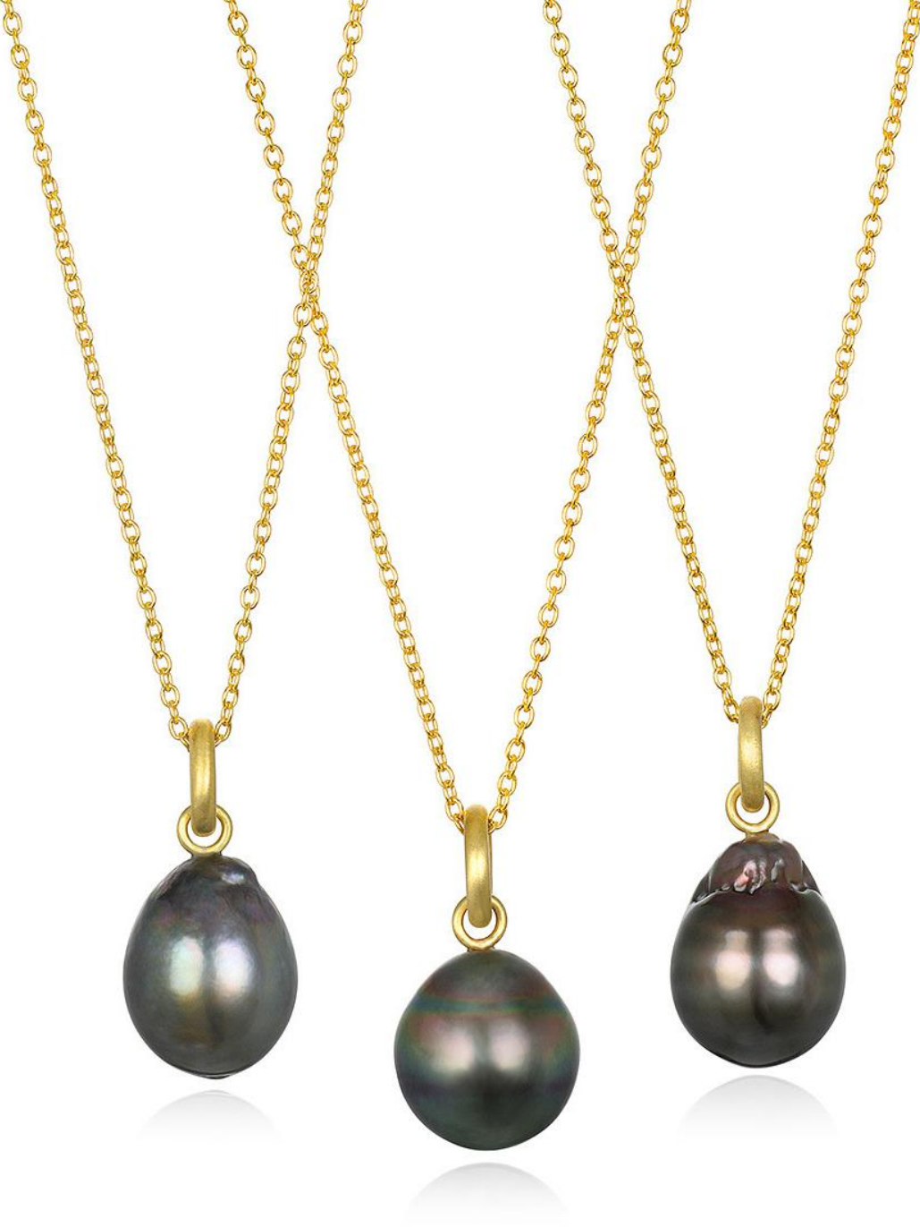
18k gold black Tahitian pearl pendants and earrings