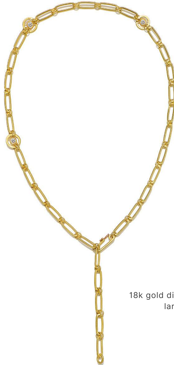
18k gold diamond pinwheel lariat chain