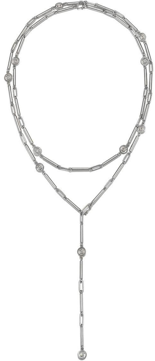
platinum and diamond tube link choker and lariat