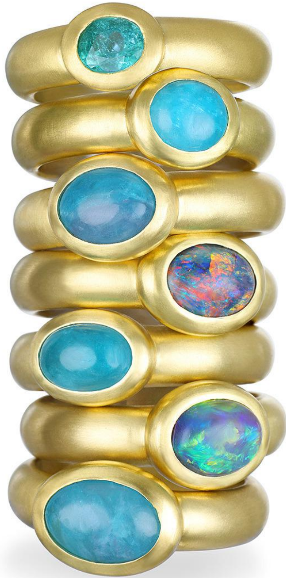
18k gold Paraiba tourmaline and Australian black opal rings