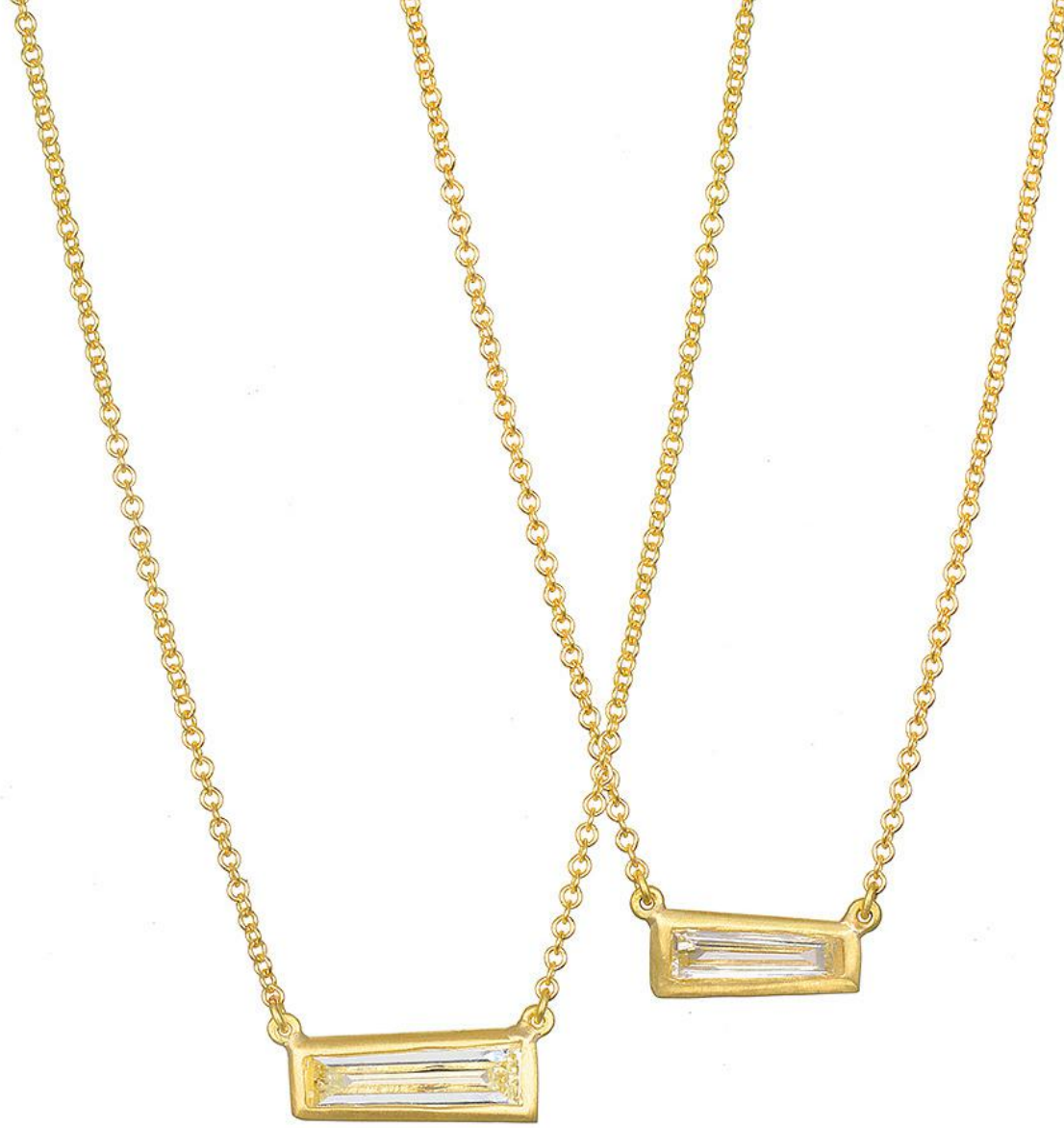
18k gold tapered baguette diamond necklaces