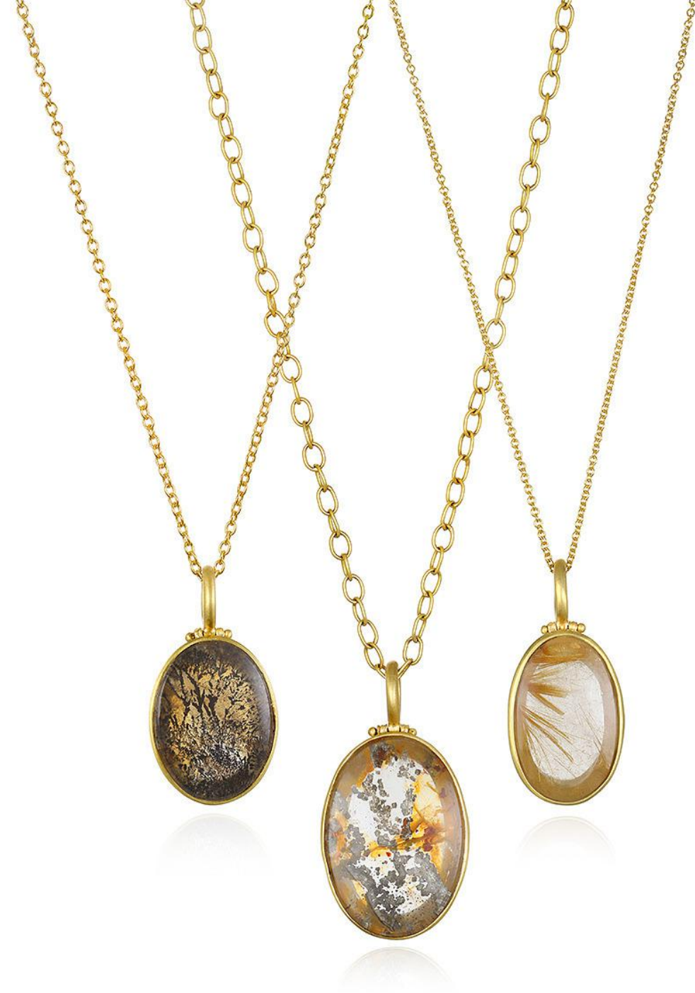
18k gold landscape agate and rutilated quartz pendants