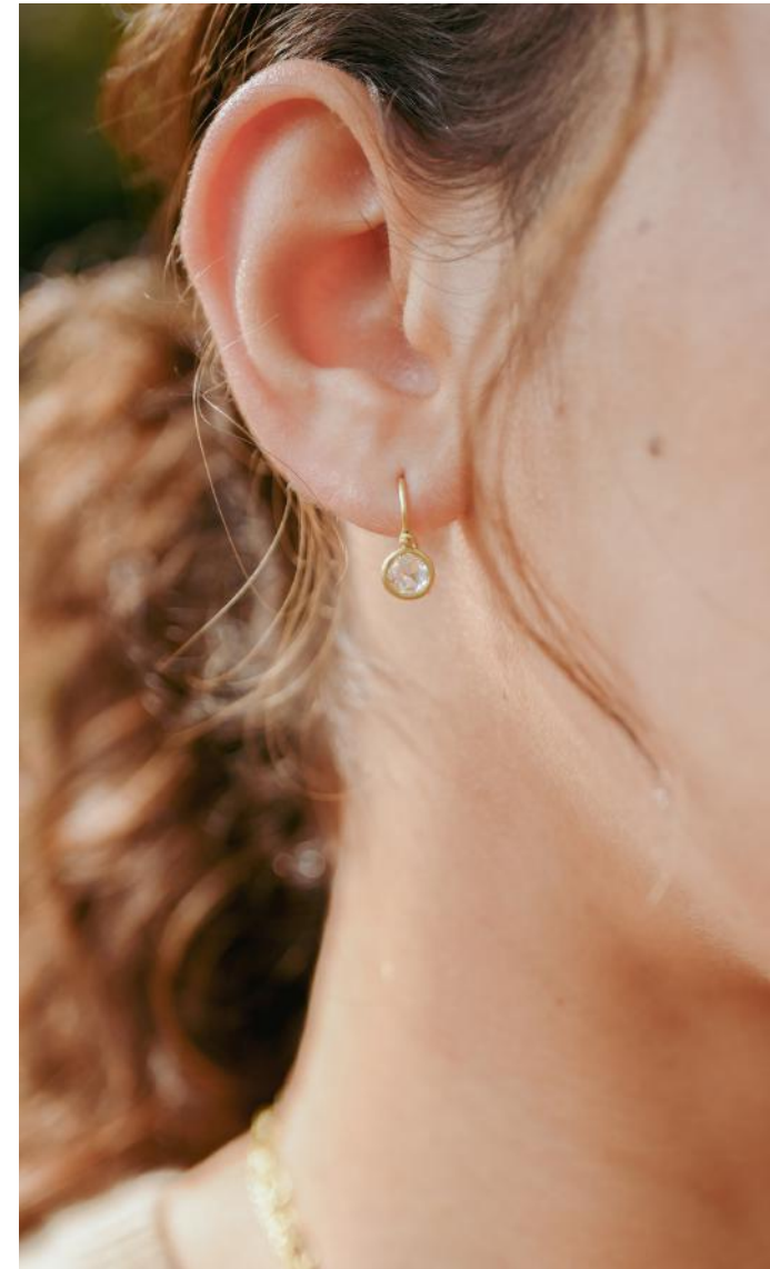
18k gold rose cut diamond and multi-colored sapphire slice earrings