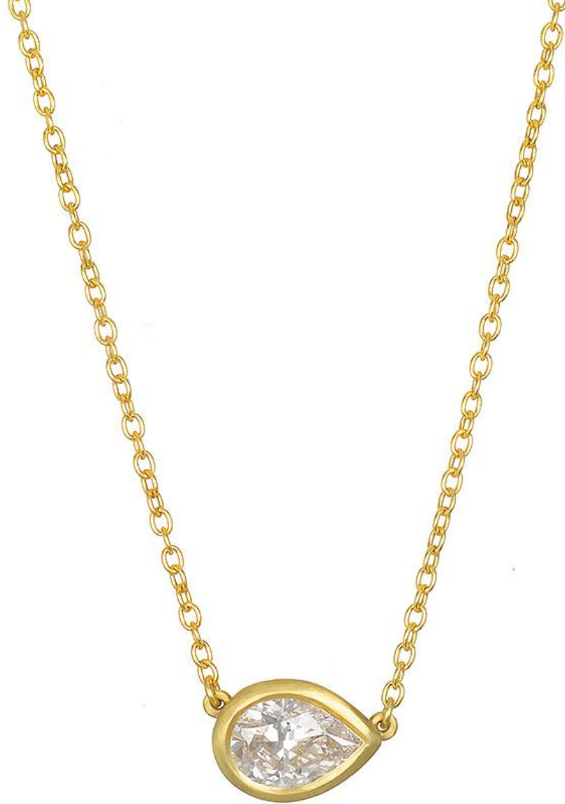
18k gold pear shaped diamond necklace

Brilliant cut for optimal sparkle, this pear-shaped diamond shines for the holidays and beyond. A delicate 18K chain lets the stone do the talking.