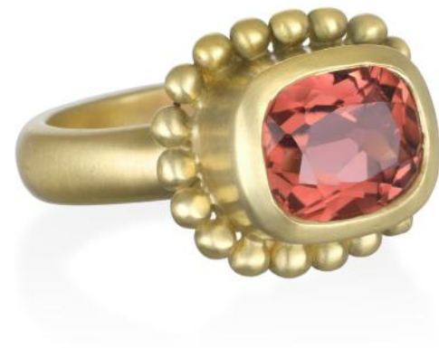
18k gold pink tourmaline ring