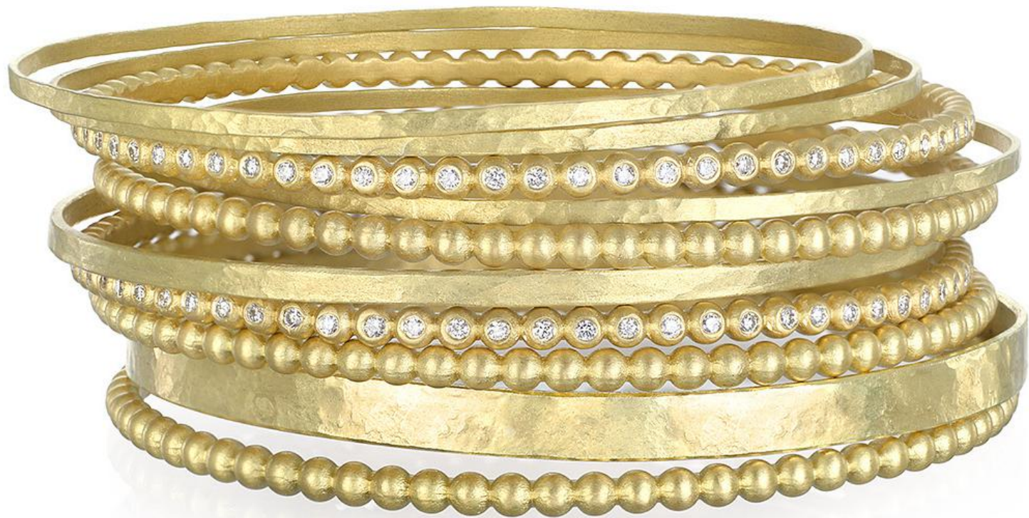
18k gold bangles