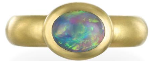
18k gold Lightning Ridge Australian black opal bezel rings