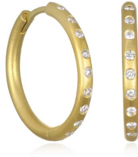
18k gold burnished diamond hoops