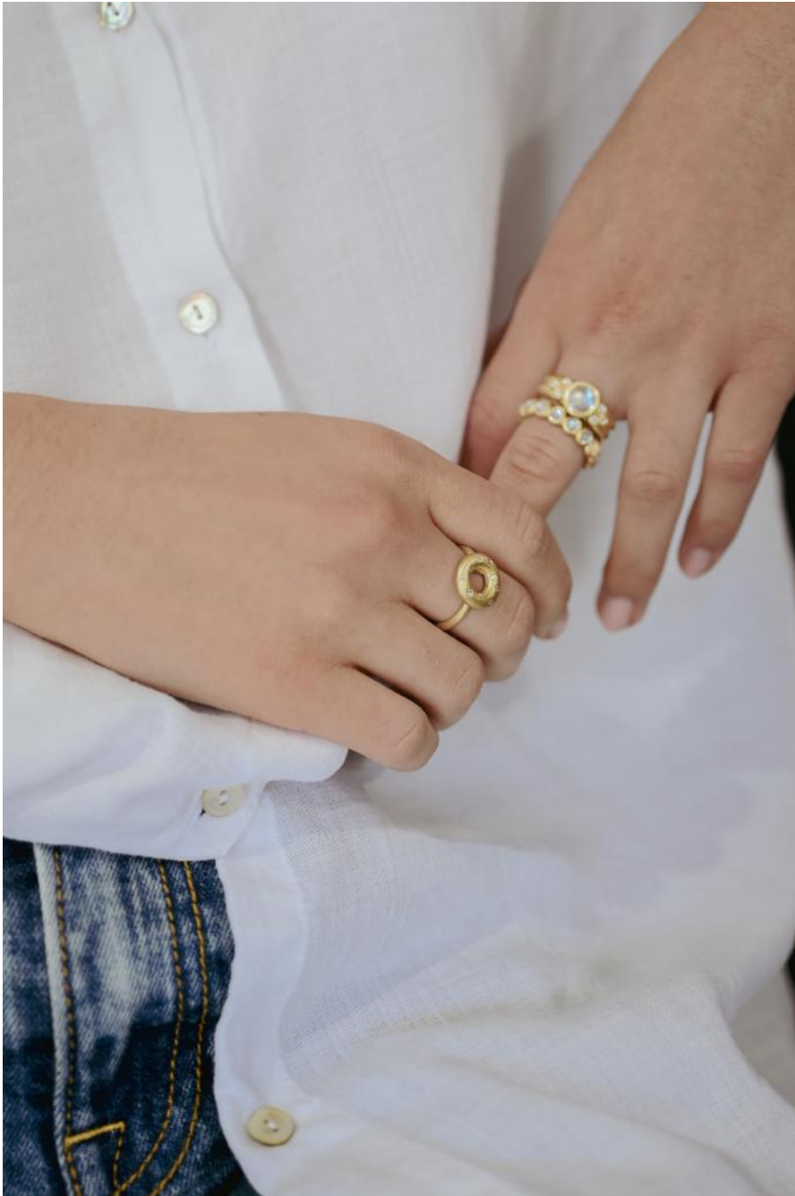
moonstone rings with diamond lifesaver ring