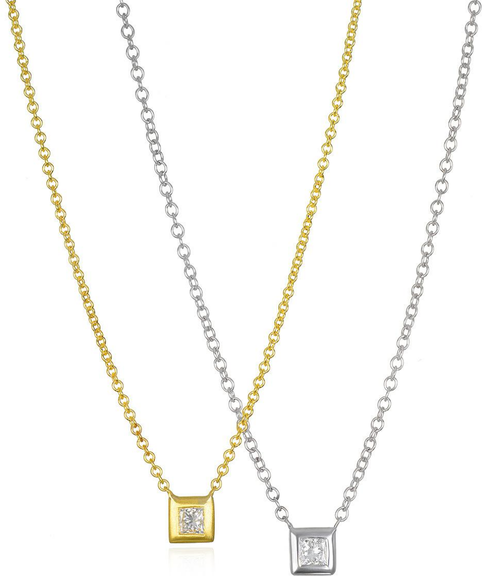
18k gold princess cut diamond station necklaces