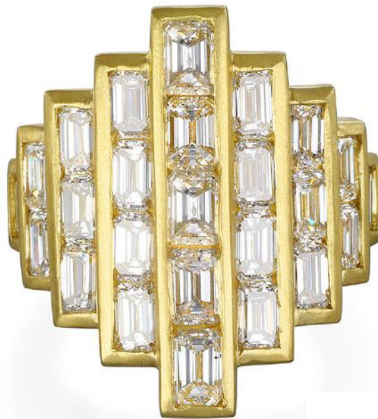
Diamond shield ring