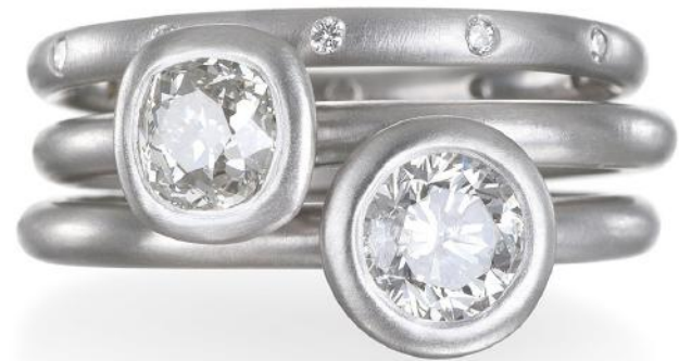
18k white sapphire freshwater pearl earrings Platinum diamond eternity band and solitaire rings