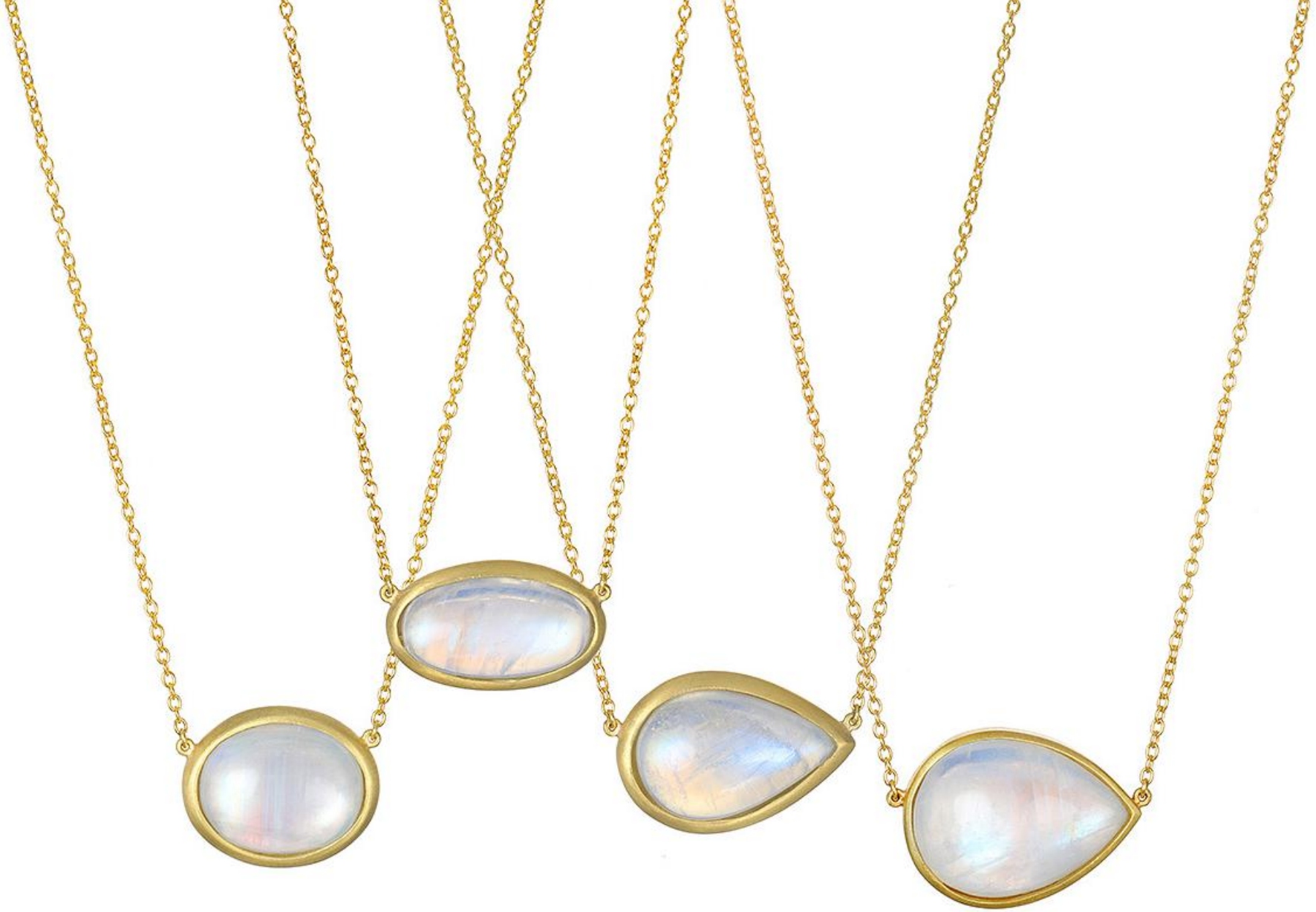
18k gold rainbow moonstone pendant necklaces