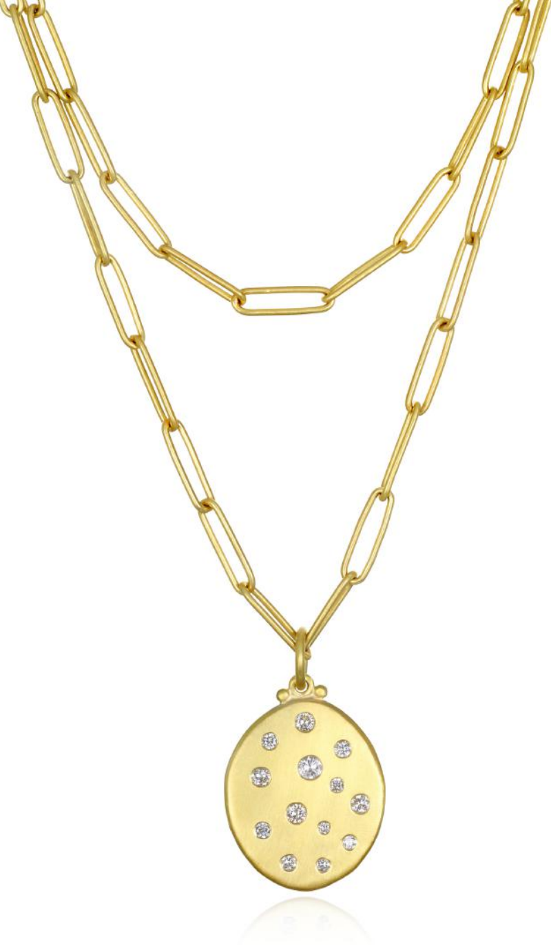
18k gold diamond dog tag pendant on paper clip chain