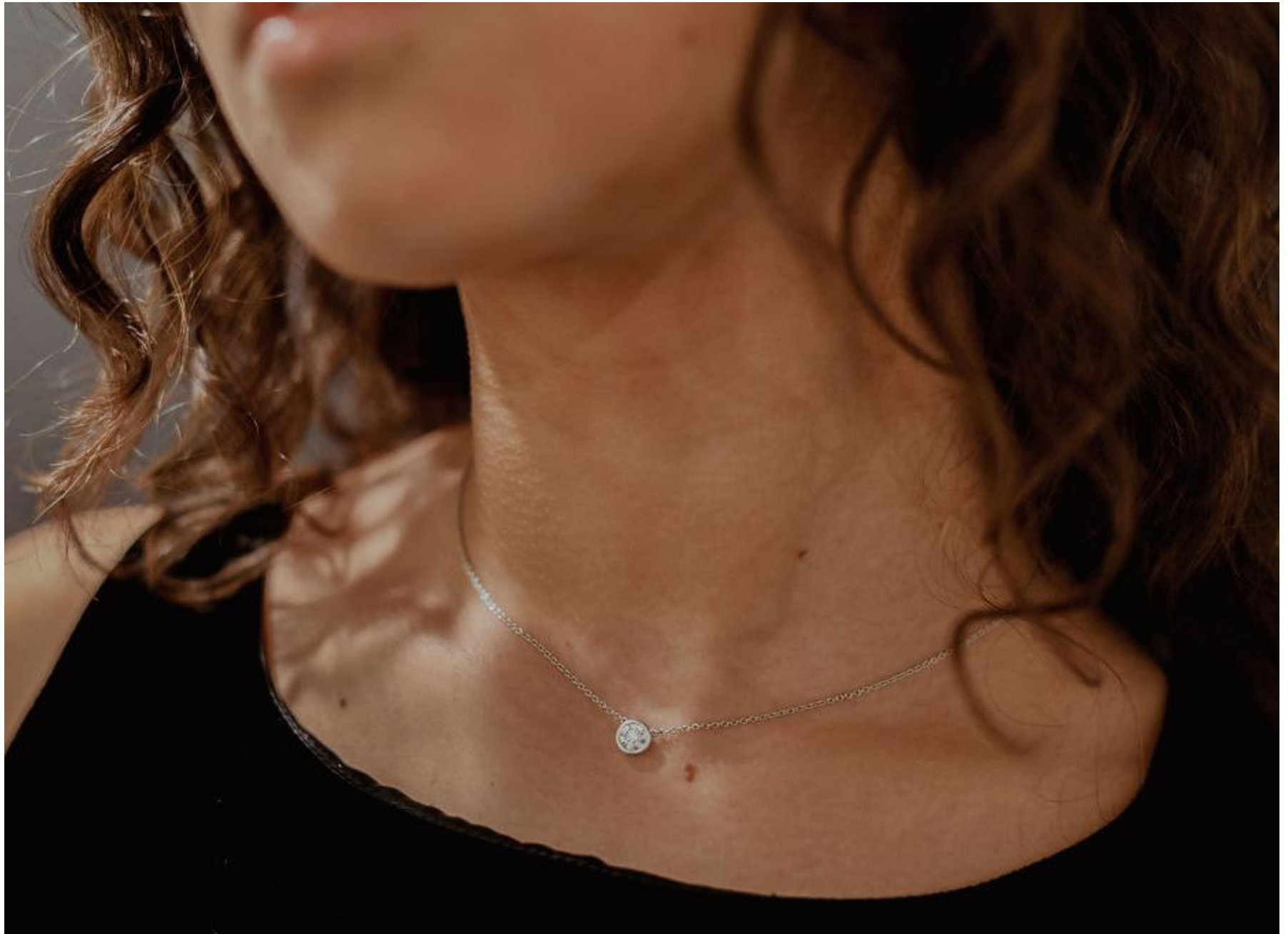
18k white gold round brilliant cut diamond solitaire necklace