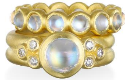
18k gold Burma moonstone eternity band 18k gold Ceylon moonstone and diamond ring