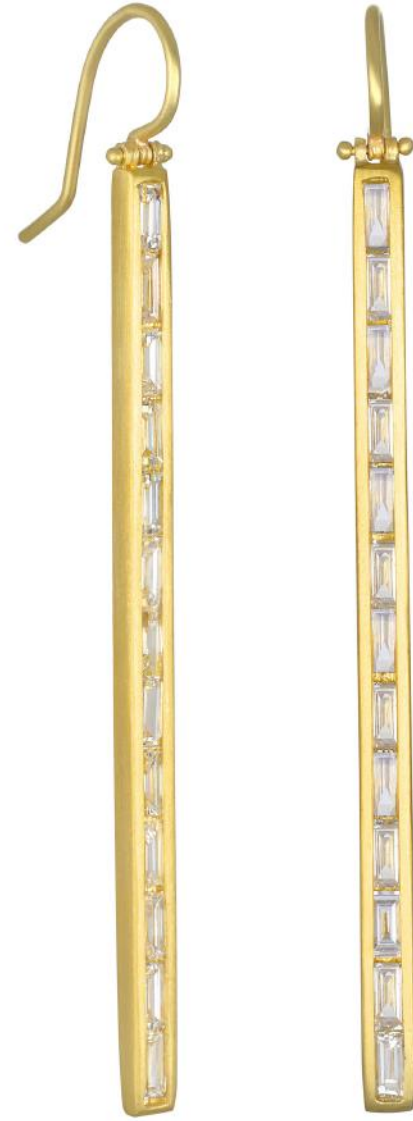
18k gold diamond baguette bar earrings