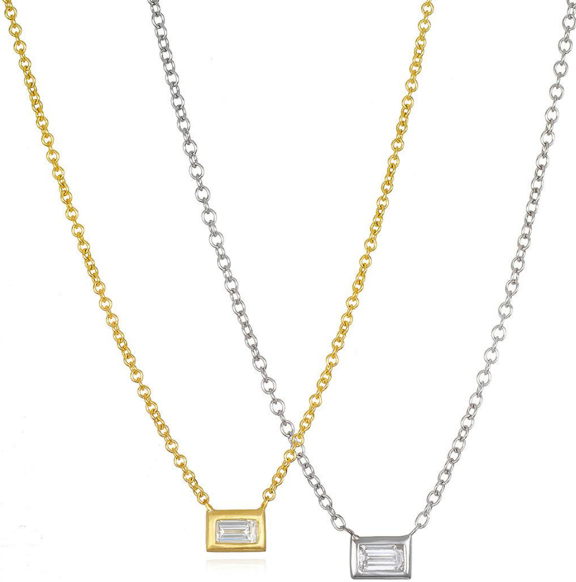
18k gold diamond baguette necklaces