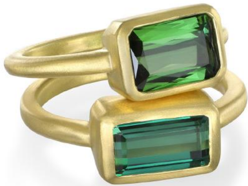
18k gold green tourmaline rings