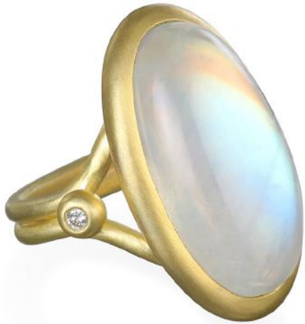
18k gold wide tapered band ring 18k gold rainbow moonstone and diamond ring