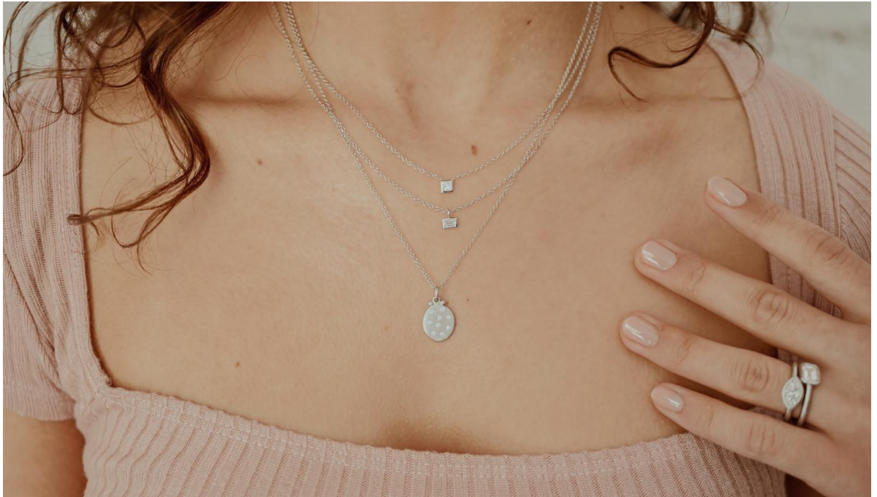
18k white gold mini diamond dog tag pendant platinum marquise and emerald cut diamond rings