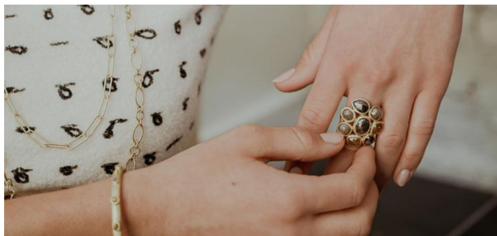
18k gold crocheted raw diamond bracelet