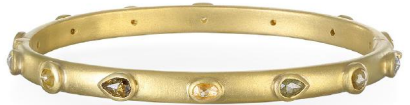
18k gold hinged bangle with milky diamonds