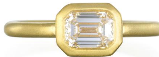
18k gold emerald cut diamond ring