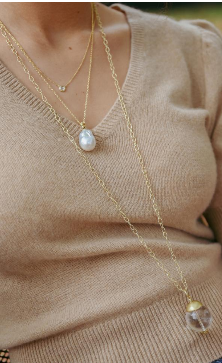
rose cut diamond necklace, South Sea pearl pendant and crystal orb pendant on oval link chain