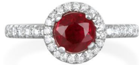
sapphire and ruby rings with diamond halo