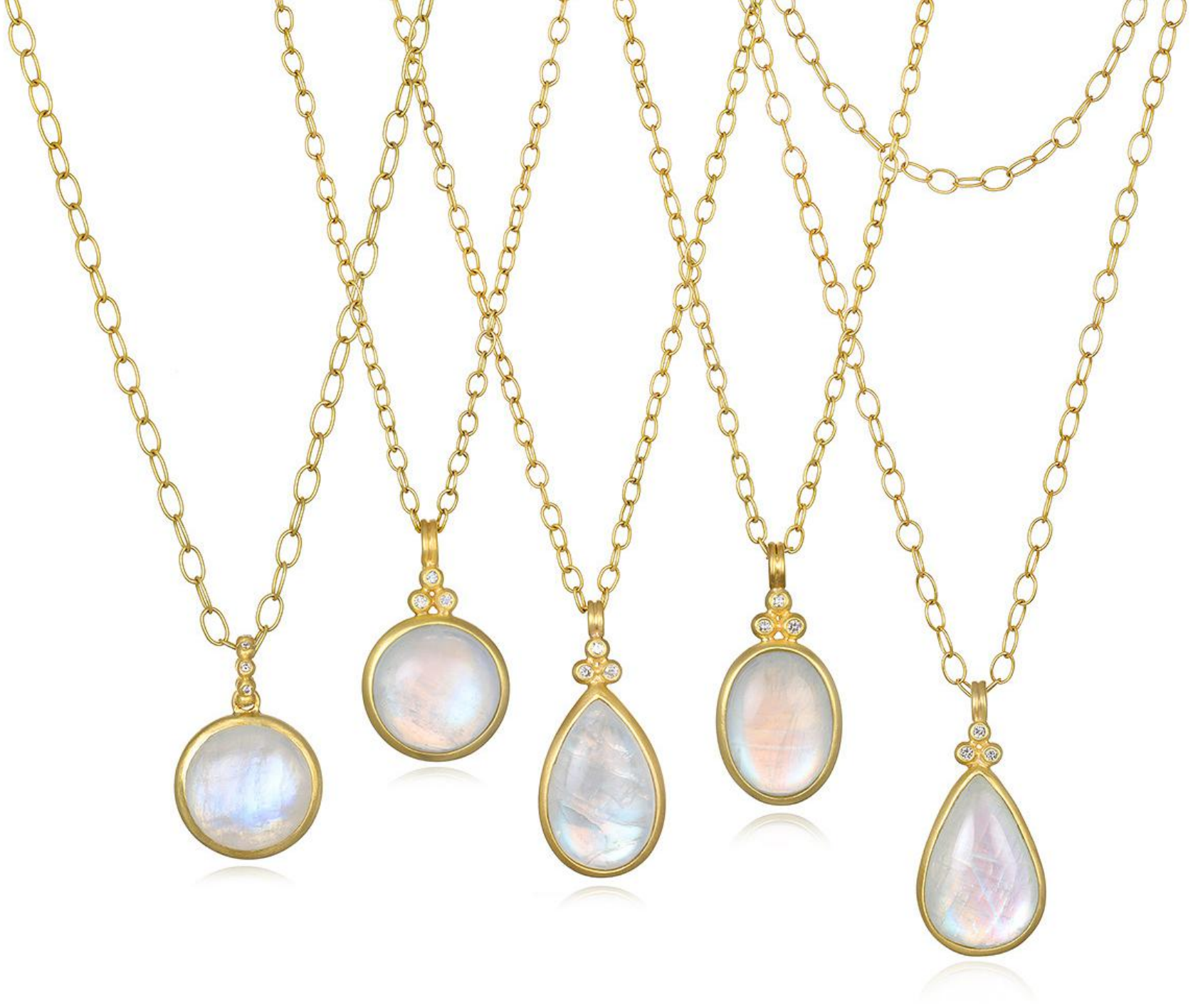
18k gold rainbow moonstone and diamond pendants on handmade chains