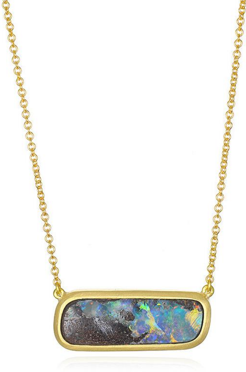
18k gold boulder opal pendant necklace