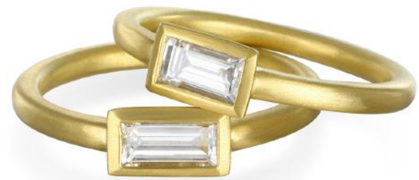
18k gold diamond baguette rings