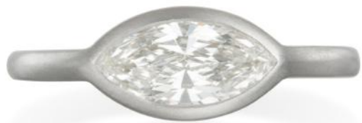
platinum marquise diamond ring