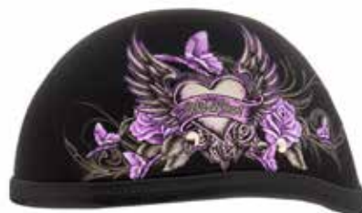
Wild At Heart (Dull Finish) 6002WH-(Size)