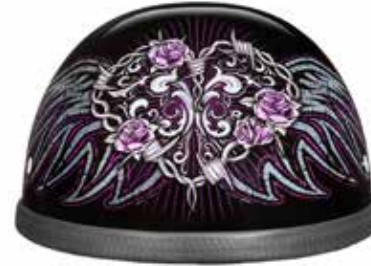
Barbed Wire Heart 6002BWH-(Size)