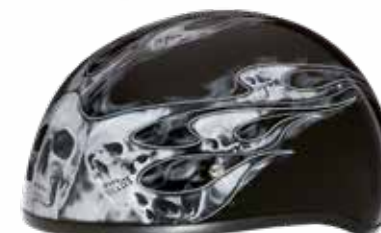
Skull Flames Silver D6-SFS-(Size)