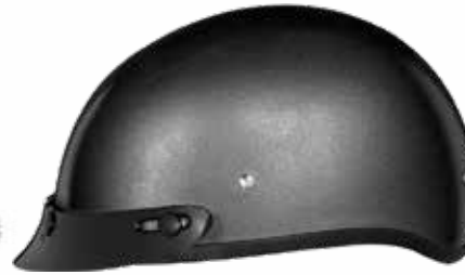
Gun Metal Grey Metallic D1-GM-(Size)