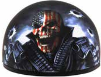
Come Get 'Em (Dull Finish) D6-CG-(Size)