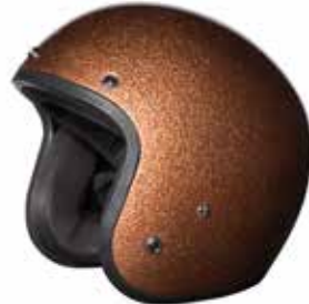
Root Beer Metal Flake DC7-RB-(Size)