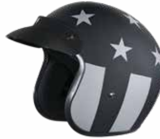
Captain America Stealth (Dull Finish) DC6-CAS-(Size)