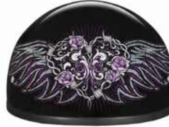
Barbed Wire Heart D6-BWH-(Size)