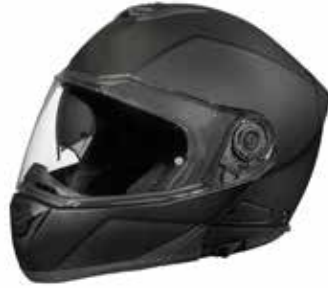
Dull Black MG1-B-(Size)