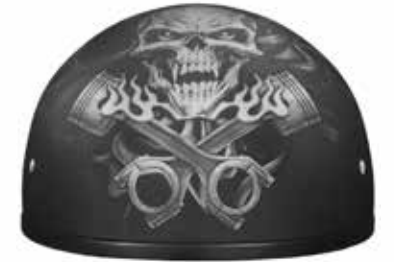
Pistons Skull (Dull Finish) D6-PS-(Size)