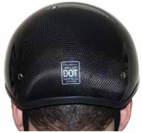
Skull Cap (Rear)