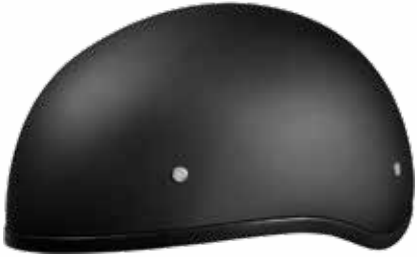
Dull Black D1-BNS-(Size)