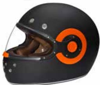
Dull Black W/ Orange Accents R1-O-(Size)