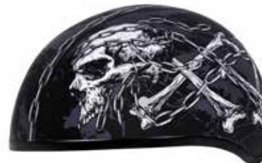
Skull Chains (Dull Finish) D6-SC-(Size)