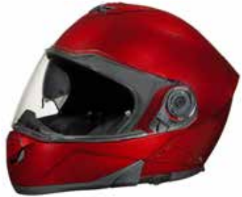
Black Cherry Metallic MG1-BC-(Size)