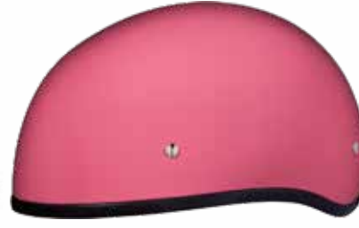
Hi-Gloss Pink D1-DNS-(Size)