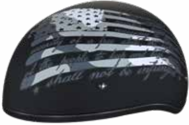
2nd Amendment (Dull Finish) D6-SA-(Size)