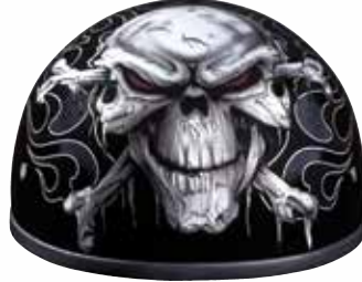
Cross Bones D6-CB-(Size)