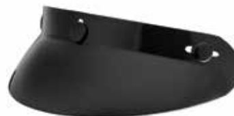
Gloss Black BV-GB