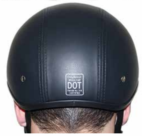
Skull Cap (Rear)