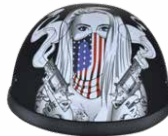
Make 'Em Pay (Dull Finish) 6002MP-(Size)