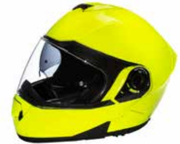
Fluorescent Yellow MG1-FY-(Size)