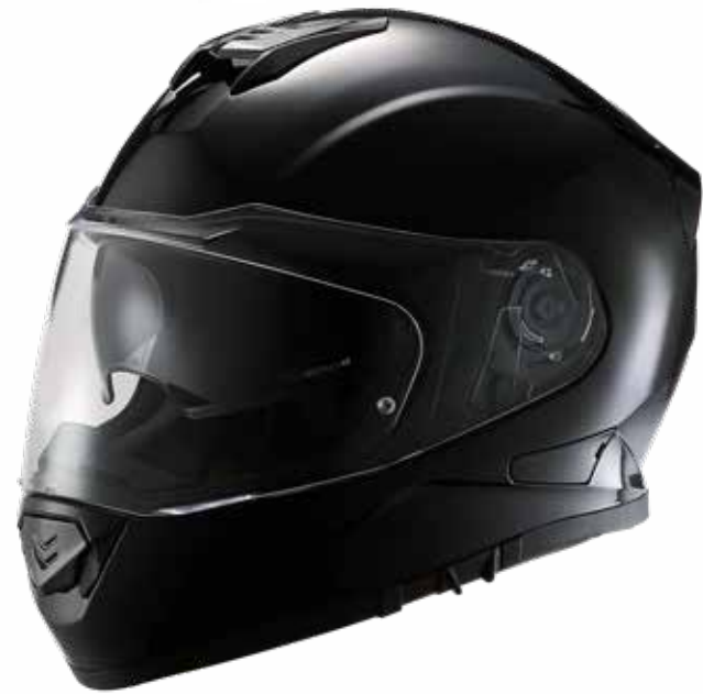
Hi-Gloss Black DE1-A-(Size)