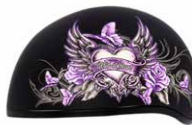
Wild At Heart (Dull Finish) D6-WH-(Size)