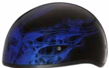
Skull Flames Blue D6-SFB-(Size)