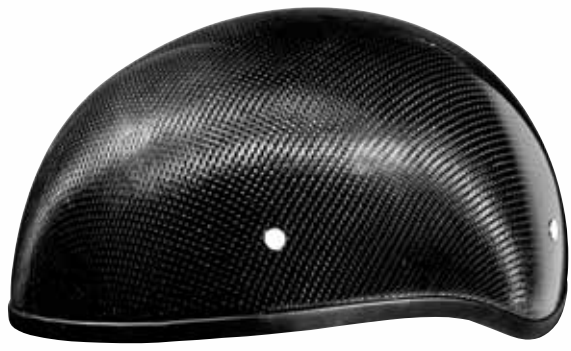
Carbon Fiber Without Visor D2-GNS-(Size)