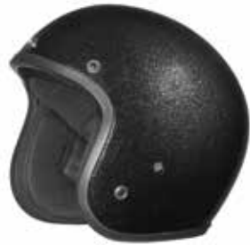
Black Metal Flake DC7-A-(Size)