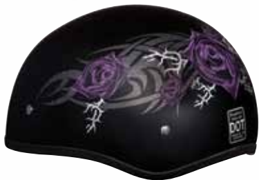
Purple Rose (Dull Finish) D6-PR-(Size)