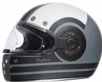
Racer (Dull Finish) R6-R-(Size)