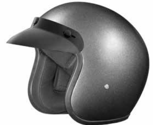
Gun Metal Grey Metallic DC1-GM-(Size)