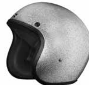
Silver Metal Flake DC7-S-(Size)