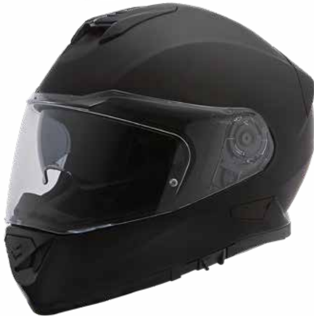
Dull Black DE1-B-(Size)