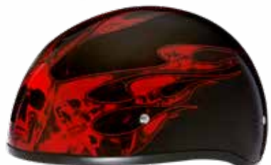
Skull Flames Red D6-SFR-(Size)