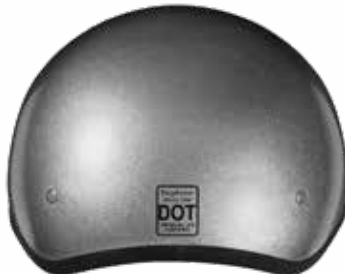
Silver Metallic (Rear) D1-SM-(Size)