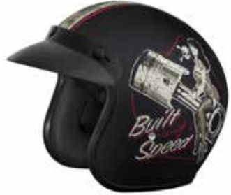
Built For Speed (Dull Finish) DC6-BFS-(Size)