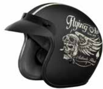
Flying Ace's (Dull Finish) DC6-FAC-(Size)