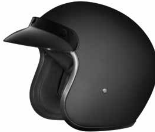
Dull Black DC1-B-(Size)