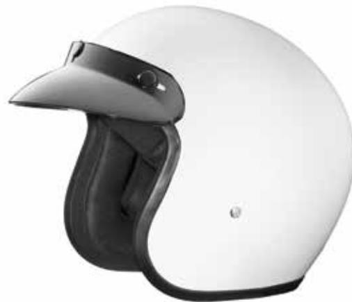
Hi-Gloss White DC1-C-(Size)