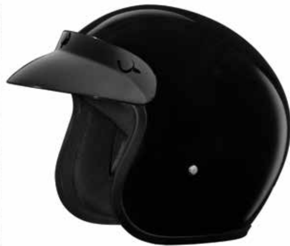
Hi-Gloss Black CDC1-A-(Size)