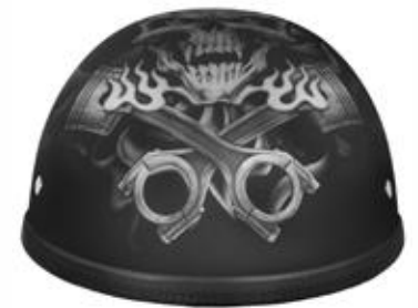
Pistons Skull (Dull Finish) 6002PS-(Size)