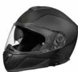
XS, S, M, L, XL.