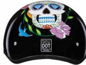
Diamond Skull D6-DS-(Size)