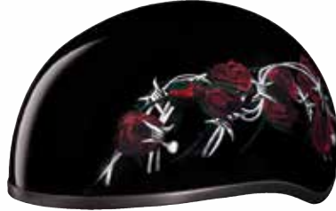
Barbed Roses D6-BRO-(Size)