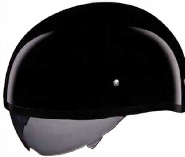
Hi-Gloss Black DSB-A-(Size)