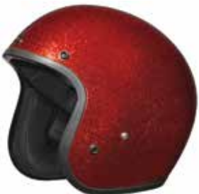
Red Metal Flake DC7-RD-(Size)