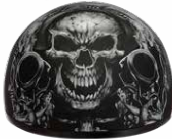
Guns (Dull Finish) D6-G-(Size)