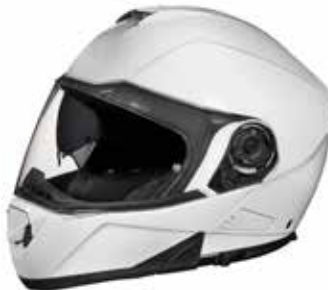
Hi-Gloss White MG1-C-(Size)