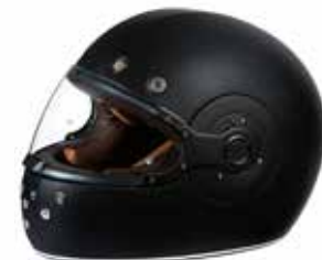
M, L, XL, 2XL.