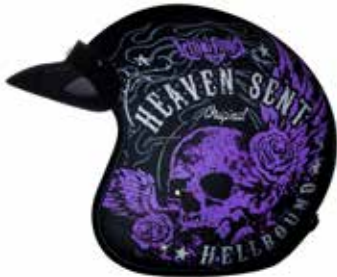
Heaven Sent (Dull Finish) DC6-HS-(Size)