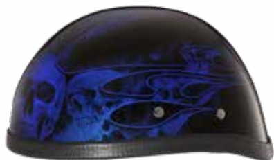
Skull Flames Blue 6002SFB-(Size)