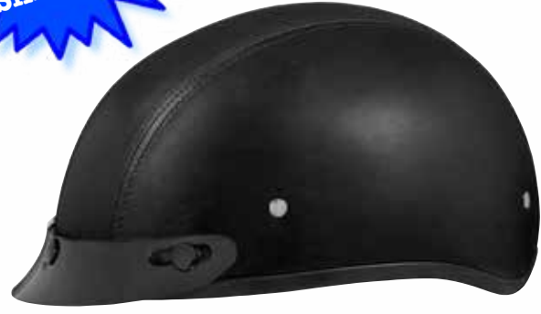
Leather With Mini Scoop Visor D3-A-(Size)