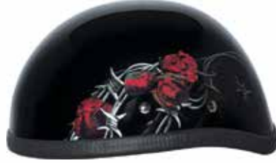
Barbed Roses 6002BRO-(Size)