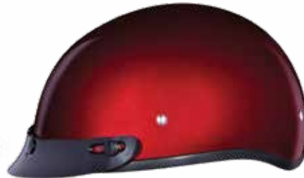
Black Cherry Metallic D1-BC-(Size)