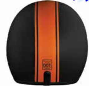
Orange Pin Stripe (Dull Finish) DC6-O-(Size)