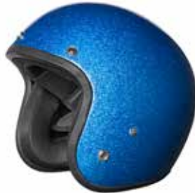
Blue Metal Flake DC7-BL-(Size)