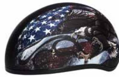
USA (Dull Finish) D6-USA-(Size)