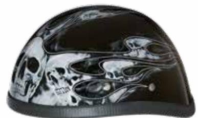
Skull Flames Silver 6002SFS-(Size)