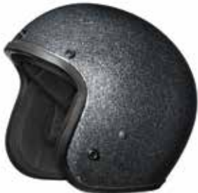
Gun Metal Flake DC7-GM-(Size)