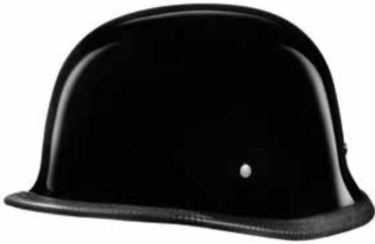
Dull Black G1-B-(Size) Or Hi-Gloss Black G1-A-(Size)