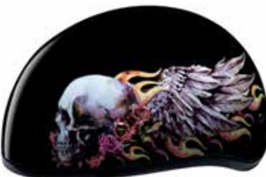
Skull Wings D6-SKW-(Size)