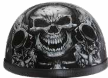
Guns (Dull Finish) 6002G-(Size)