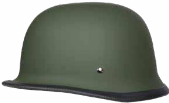
Military Green G1-MG-(Size)

D.O.T. German Sizes: XS-XL. D.O.T. Hawk Sizes: 2XS-XL.