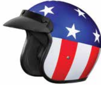
Captain America DC6-CA-(Size)