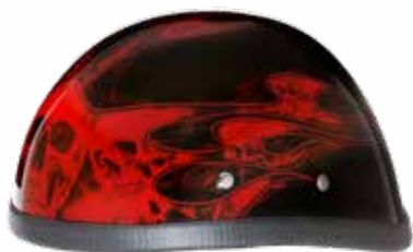
Skull Flames Red 6002SFR-(Size)