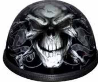
Cross Bones 6002CB-(Size)