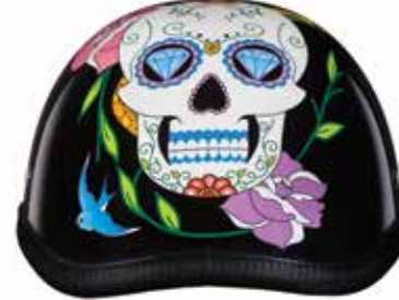
Diamond Skull 6002DS-(Size)