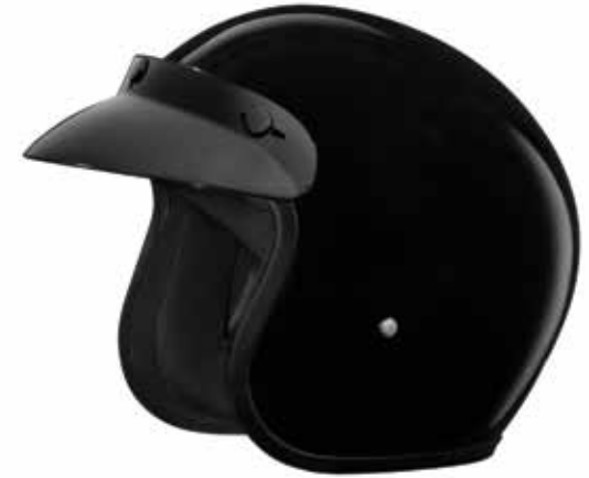
Hi-Gloss Black DC1-A-(Size)