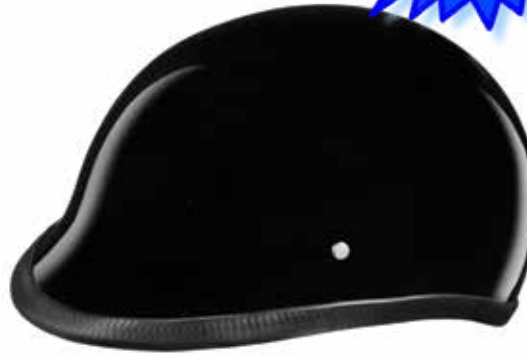
Dull Black H1-B-(Size) Or Hi-Gloss Black H1-A-(Size)