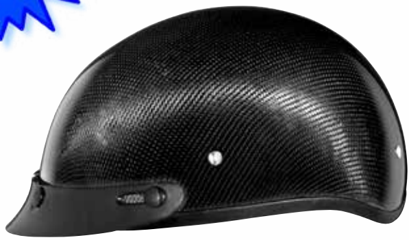
Carbon Fiber With Mini Scoop Visor D2-G-(Size)