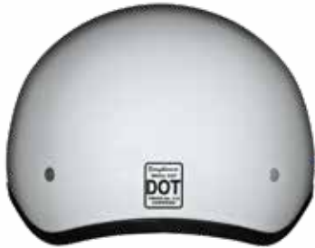
Pearl White (Rear) D1-PW-(Size)