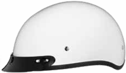
Hi-Gloss White D1-C-(Size)