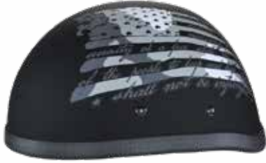
2nd Amendment (Dull Finish) 6002SA-(Size)