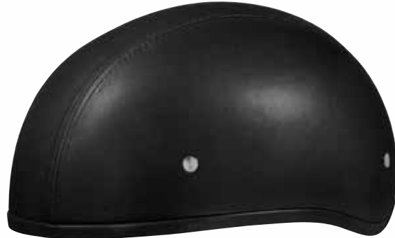
Leather Without Visor D3-ANS-(Size)