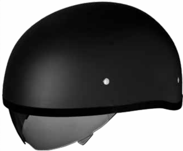
Dull Black DSB-B-(Size)