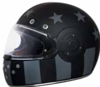
Captain America Stealth (Dull Finish) R6-CAS-(Size)