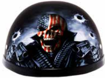
Come Get 'Em (Dull Finish) 6002CG-(Size)