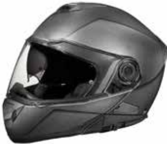
Gun Metal Grey Metallic MG1-GM-(Size)