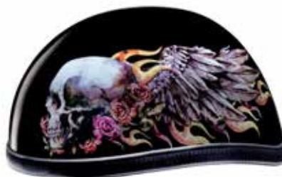
Skull Wings 6002SKW-(Size)