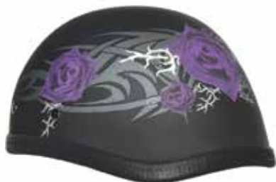
Purple Rose (Dull Finish) 6002PR-(Size)