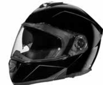
Hi-Gloss Black MG1-A-(Size)