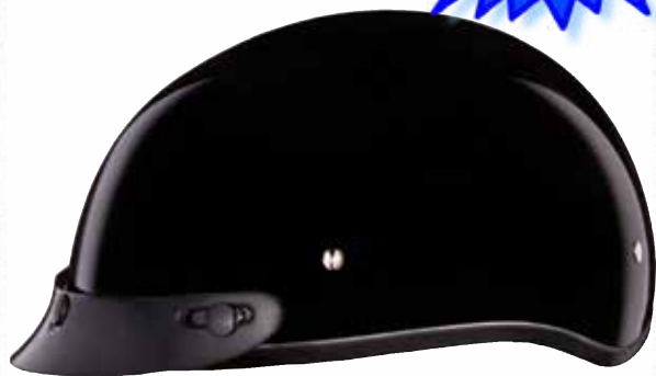
Hi-Gloss Black CD1-A-(Size)

The Smallest D.O.T. 1/2 Shell Helmet Ever Made!! Quick Release Lock Retention System.