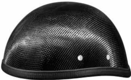
Carbon Fiber 2002G-(Size)