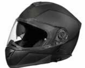
2XL, 3XL, 4XL.