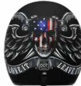
Love It (Dull Finish) DC6-L-(Size)