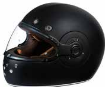
Dull Black W/ Dull Black Accents R1-B-(Size)