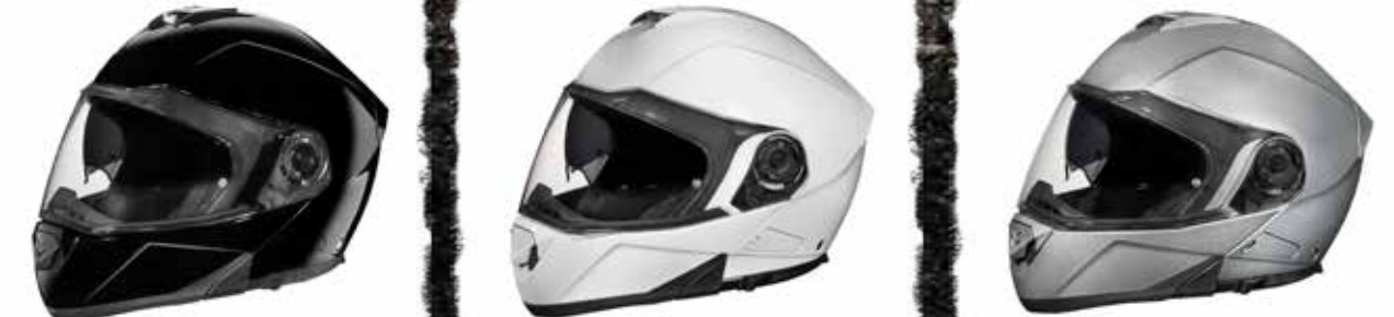
Silver Metallic MG1-SM-(Size)