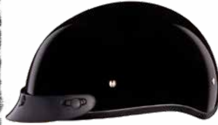
Hi-Gloss Black D1-A-(Size)