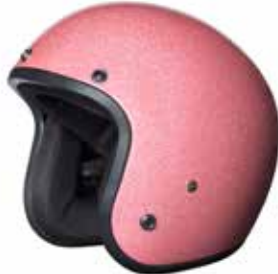
Pink Metal Flake DC7-P-(Size)