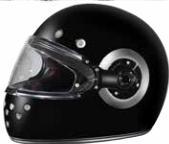
Hi-Gloss Black W/ Chrome Accents R1-A-(Size)