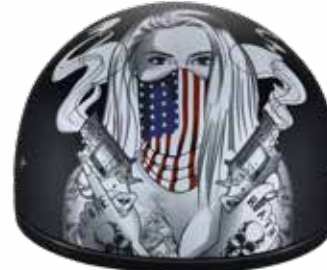
Make 'Em Pay (Dull Finish) D6-MP-(Size)