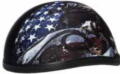
USA (Dull Finish) 6002USA-(Size)