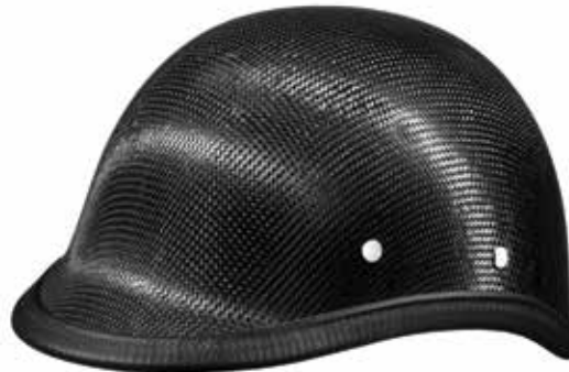
Carbon Fiber 2003G-(Size)