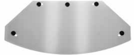
Clear Or Smoke TOS-C TOS-S

Custom Made To Fit Our 5 Snap Daytona Cruiser Metal Flake Models.