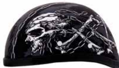
Skull Chains (Dull Finish) 6002SC-(Size)