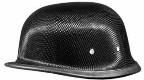
Carbon Fiber 2004G-(Size)