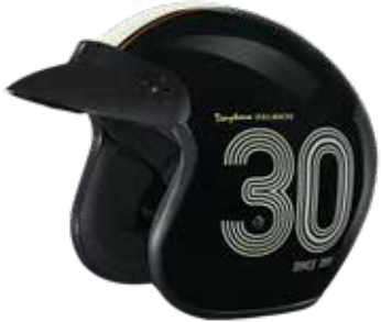
Daytona 30th DC6-DAY-(Size)