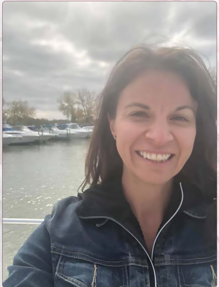
This picture was taken at the marina I've been going to my entire life! I've moved many times but Lake Erie will always be home.

What is your favorite holiday? 4th of July- because of boating and warm sunny days