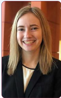
Francis J. Monigan Memorial Scholarship

and for encouraging future STEM leaders. The community that Phi Sigma Rho has provided to me has been invaluable, and I am looking forward to staying involved with Phi Sigma Rho as both a graduate student and an alumna. With this scholarship and the support of the Phi Sigma Rho Foundation, I am able to continue my studies as a Master of Information & Data Science student at UC Berkeley with the hopes of applying what I learn in the energy industry to fight against climate change.