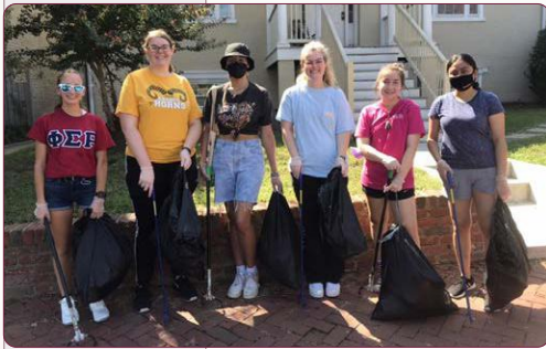
Additionally, on September 19th, we had a trash cleanup here in Richmond.