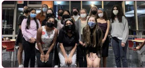
We also started doing spirit days during chapter. Above is a picture of the dress to pin one! We've had neon day, VCU merch day, phi rho merch day, flannel day, and pink day.