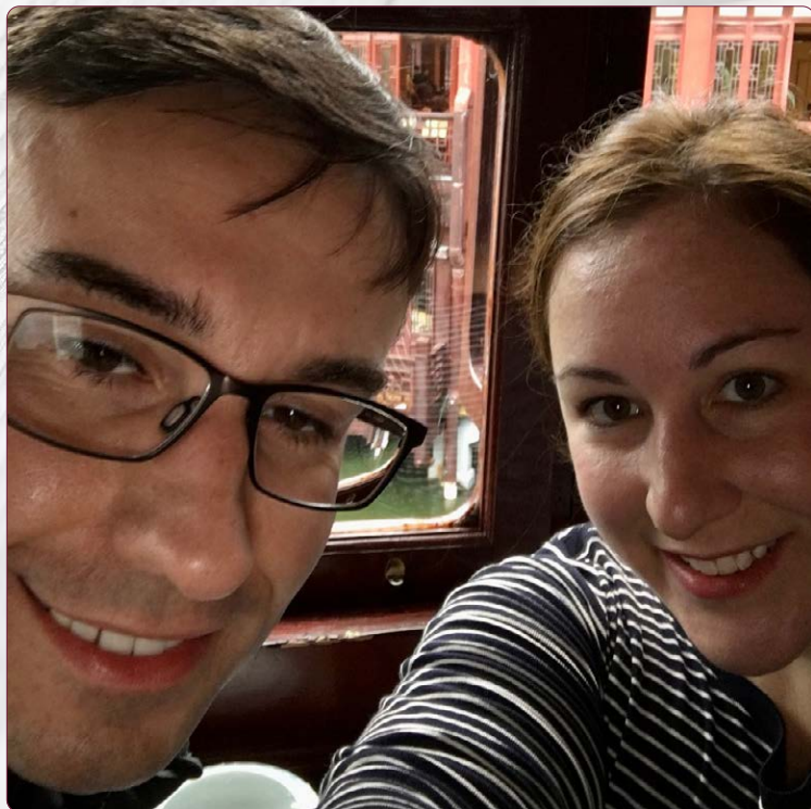
This is a photo of me and my husband at a tea house in Shanghai. When we can, we love to travel and explore new places.

What is your favorite holiday? My favorite holiday is Halloween. I love fall, especially in New England, and the months leading up to Halloween are full of gorgeous fall scenery, good food, college football, and fun fall outings like picking pumpkins and apple picking. It is my absolute favorite time of the year!