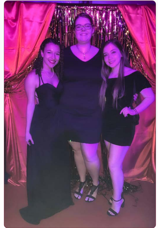
Lastly, we had Semi-formal on November 5th.