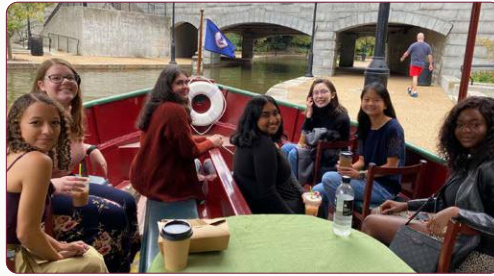
Furthermore, on October 9th, we had a Sisterhood retreat at Riverfront Canal Cruise.