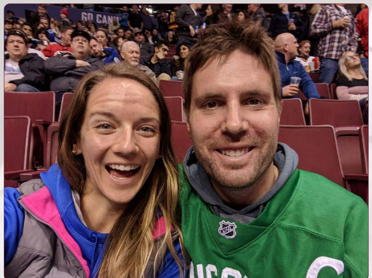
This photo of me and my husband was taken on one of our many hockey vacations, this time to Vancouver, BC (also a frequent non-COVID destination!). He has a goal to visit every NHL arena and I want to run a marathon in all 50 states, so we normally travel a lot!

What is your favorite holiday? I LOVE Halloween, mostly for the 3 Musketeers and Reese's candy, but also because I can design and sew fun Disney-themed costumes! And it helps that fall is my favorite season...when I lived in Arizona, it meant that the weather was finally cool enough to be outside most of the time, but now that I'm living in a place with real fall, it means crunchy leaves, sweater weather, pumpkin everything, the start of hockey season, great marathon racing weather...what's not to love!?