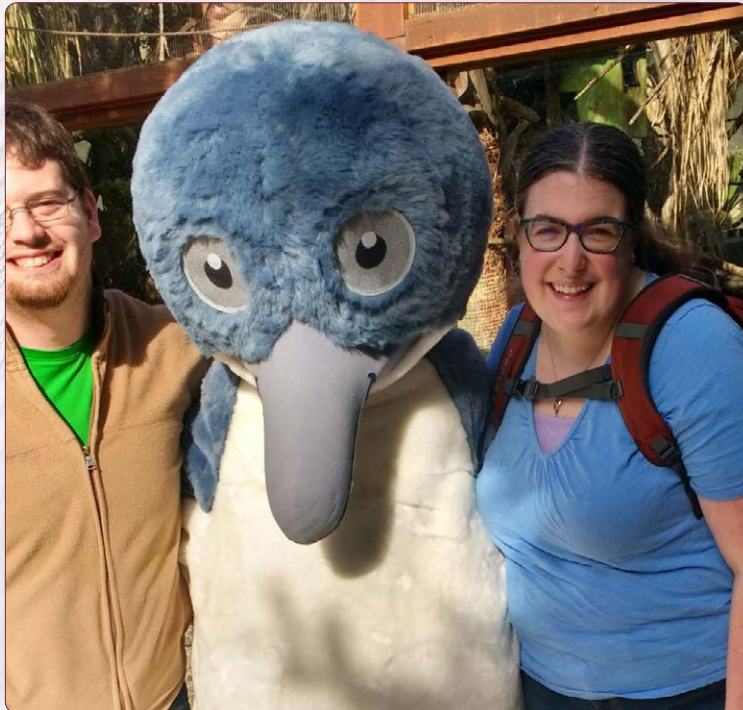
This photo is of me and my spouse at the Wellington Zoo in New Zealand with their little blue penguin mascot. We love to travel (especially colder locations) and equally love getting back home and spending time in our neighborhood and at home with our two cats.

What is your favorite holiday? Thanksgiving and Christmas since both focus on time with family and reconnecting with each other. Even during COVID we have found creative ways virtually or outside to see each other and those have created special memories and also made me realize how much I took our normal traditions for granted.