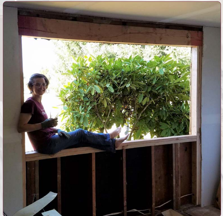
This is a photo of our '70s ranch house remodel, which we started in 2018 and took down to studs. We had just expanded this bedroom window and added a new header (the beam at the top).

What is your favorite holiday? My favorite holiday is Halloween, because I love to dress up. I helped set up/take down local Renaissance Faires in high school, and have been finding opportunities to get into garb of any kind ever since.