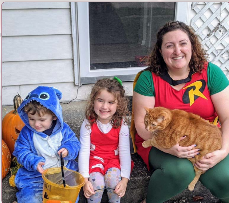
This is a picture of two of my five(!) nieces and nephews this year on Halloween. People ask why I moved back to Cleveland, and here is why!

What is your favorite holiday? Without a doubt Thanksgiving. I love coming together to celebrate family. I have continued my Grandma's tradition of making sticky buns for Thanksgiving, and I love sharing the traditions and results with my family.