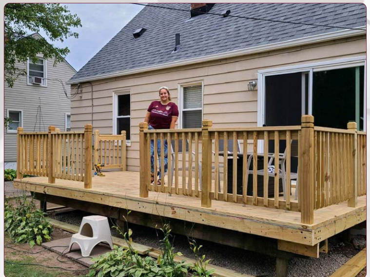
Deck my dad and I built at my new house this summer! Stairs are still in the works.

What is your favorite holiday? My favorite holiday is Kentucky Derby Day! Being from Kentucky it was always a big deal to go dress up, wear a nice hat, eat the Kentucky staples and watch the horse race. Now that I live in Michigan I host a party every year to celebrate and it has been fun introducing my friends from other states to the Kentucky traditions! Quite a few friends have also invested in some nice Derby hats they can show off each year.