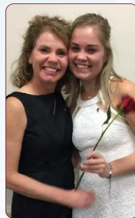
Anne Louise Roach Legacy Scholarship

values he found most important - grit, compassion, and a desire for helping others. Joining Phi Sigma Rho has been one of the best decisions I have made during my time in college. The academic, professional, and social support I have received from my sisters continues to exceed my expectations, and I am excited to continue to stay engaged with this community throughout the rest of my life. PRL!