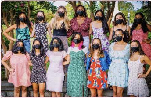
This semester as a chapter, we had a floral photoshoot on Saturday, September 11th.