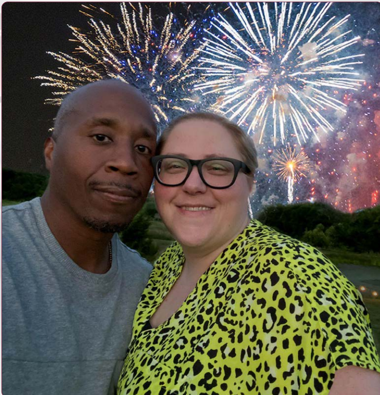
4th of July in Arkansas

What is your favorite holiday? Thanksgiving. I love getting together with friends and family and the food.