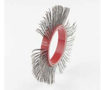
BRISTLE BLASTER® BELT, STEEL, 11 MM