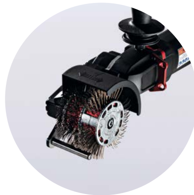
BRISTLE BLASTER® DOUBLE