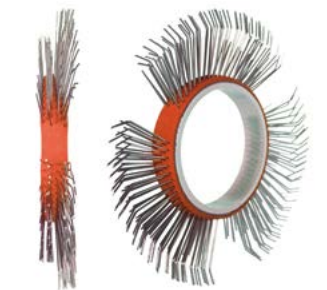
BRISTLE BLASTER® AXIAL BELT, STAINLESS STEEL, 11 MM, LEFT