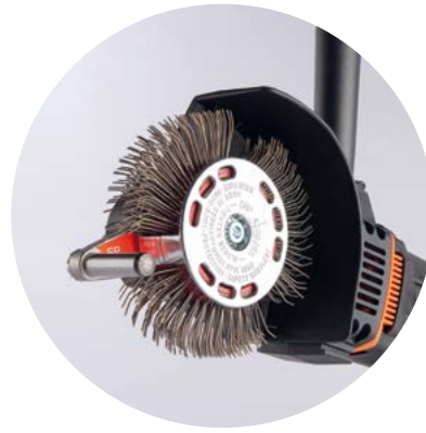
BRISTLE BLASTER® ELECTRIC