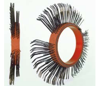
BRISTLE BLASTER® AXIAL BELT, STEEL, 11 MM, RIGHT