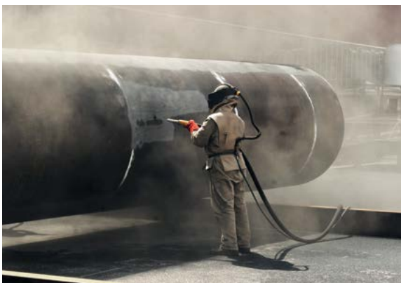
Conventional grit blasting