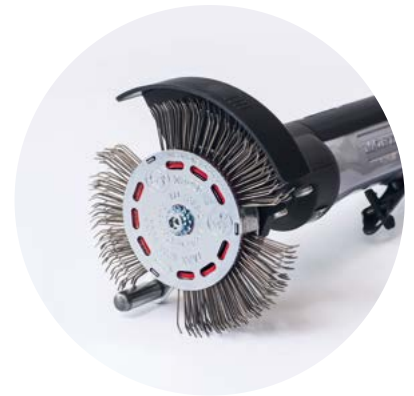
BRISTLE BLASTER® AXIAL