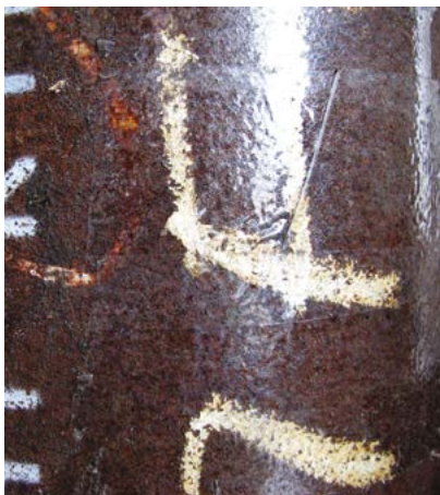
API 5L Piping