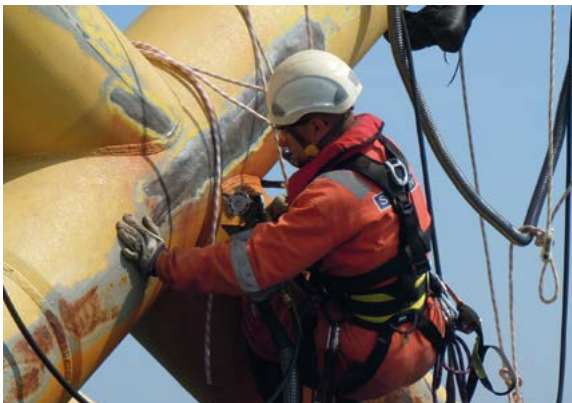
Bristle blaster® on an offshore platform

Absolutely Gründlich stands for a thorough and sustainable long-term protection of your assets. MontiPower®-preparation from scratch!