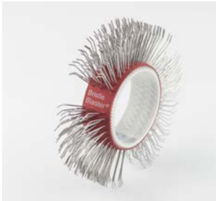
BRISTLE BLASTER® BELT, STAINLESS STEEL, 23 MM