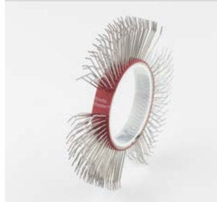
BRISTLE BLASTER® BELT, STAINLESS STEEL, 11 MM