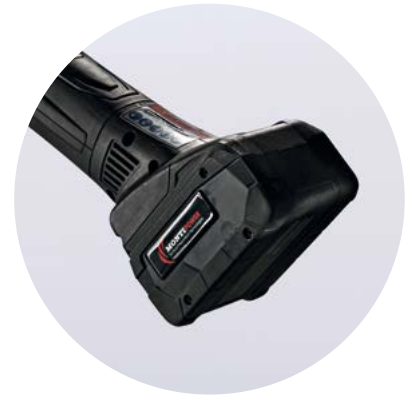
BRISTLE BLASTER® CORDLESS