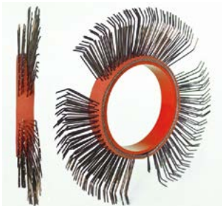
BRISTLE BLASTER® AXIAL BELT, STEEL, 11 MM, LEFT