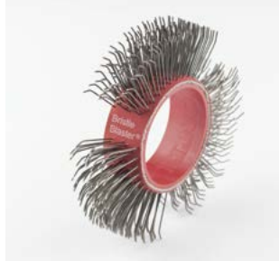
BRISTLE BLASTER® BELT, STEEL, 23 MM