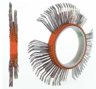
BRISTLE BLASTER® AXIAL BELT, STAINLESS STEEL, 11 MM, RIGHT