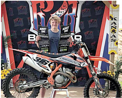
▲ Brady DeYoung 450B / 450B Limited