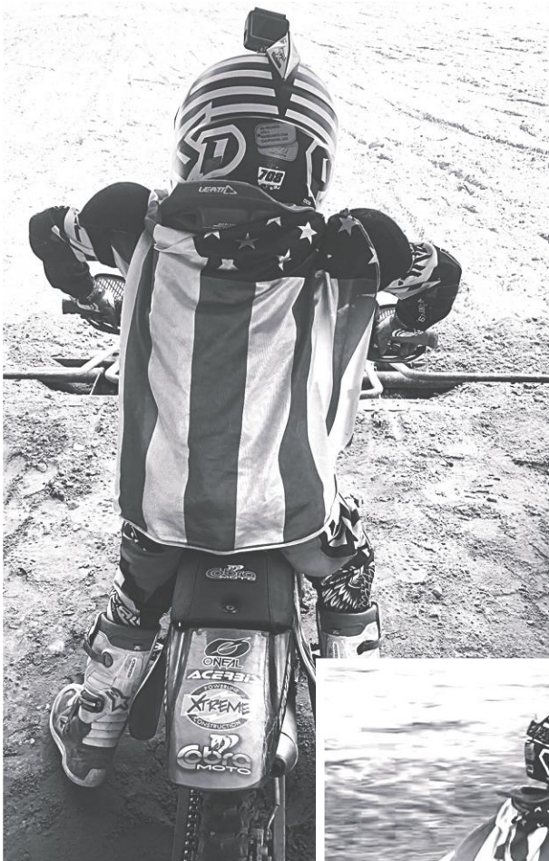
#708 Feeling patriotic in the 50sr class at Big Air MX 7-5-2020