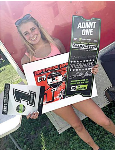
▲ Landrey Hazen Womens & Girls