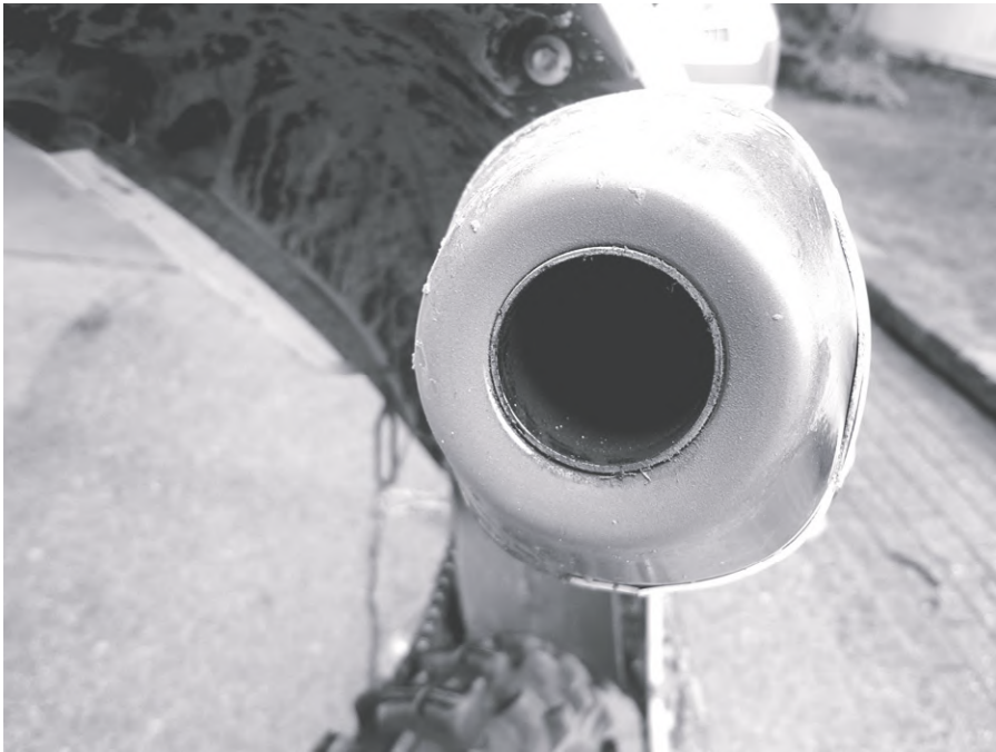
▲ Clean as a whistle...

bike through turns, but it made the handlebars seem narrower, even when cut to the same width. The new frame contributed to a more precise feel on the trail, and the new footpegs provided an insane amount of grip for our feet. The bodywork was clean and didn't snag the rider when moving around, and the notch in the right side panel that used to snag the back of my calf has been eliminated.