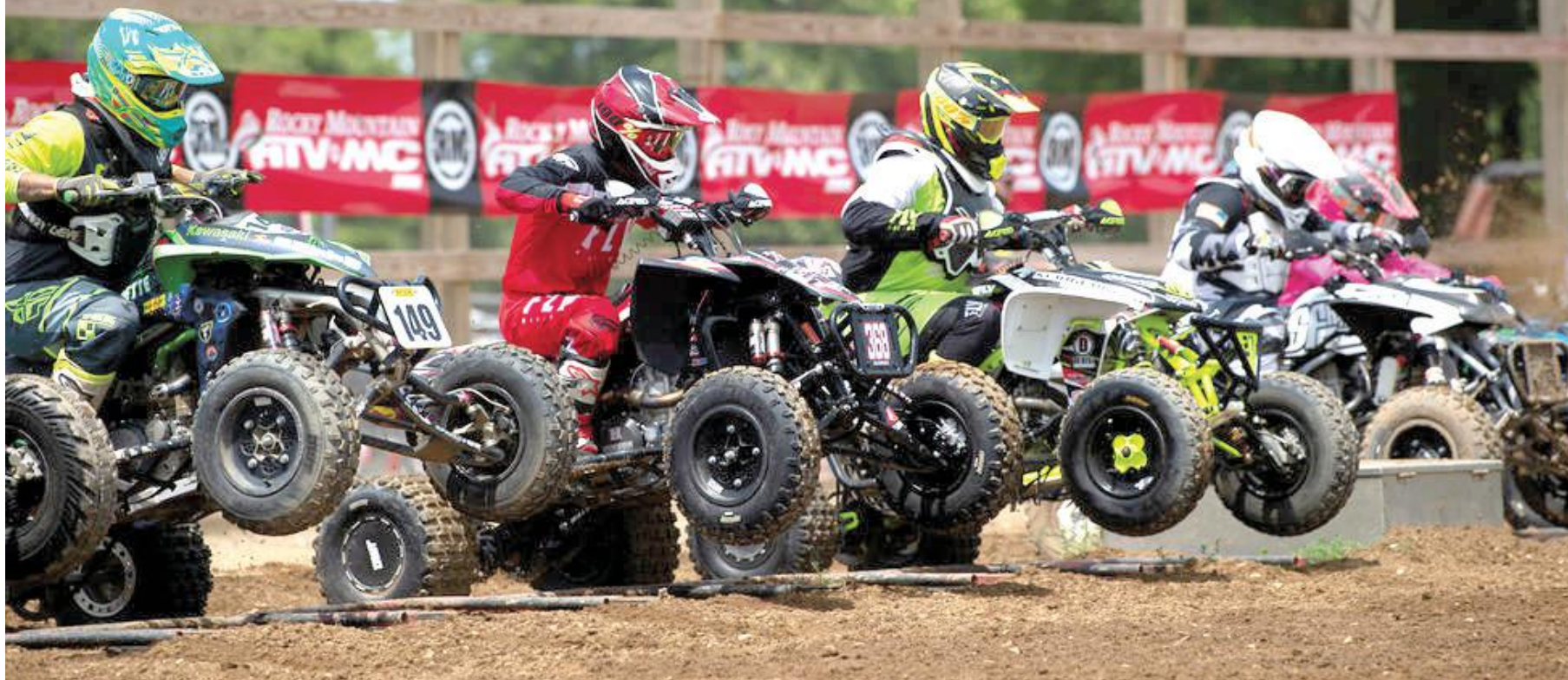
▲ Riders charging off the gate

With the ATV Nationals rolling into RedBud July 24-26th it gave our District riders a chance to line up with the fastest in the country. We had full gates thanks to racers traveling from as far as Texas and Florida for the event. The heat and notorious RedBud soil proceeded to test all everyone throughout the weekend.