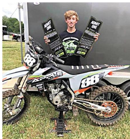
▲ Cole Apple 250 450 C Limited