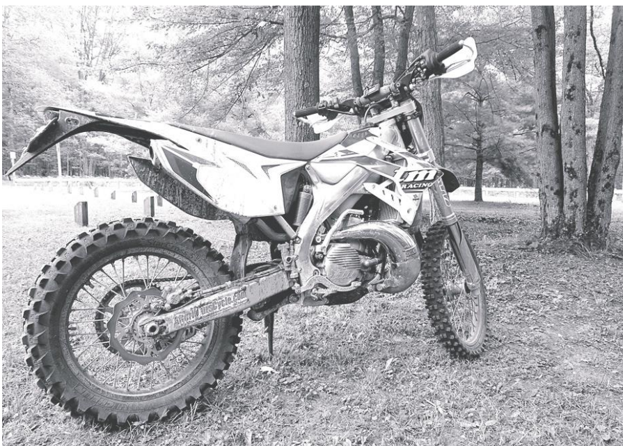
▲ Exotic, but accessible

Beta's continued development efforts in terms of engine character were noticeable. The new counterbalancer smooths out much of the engine vibration (more so than on the 300) and new porting and ignition timing created a lively, spritely engine feel. There were no issues attacking any of the rocky and rooty hills at Evert, as clutch action and the spacing of the six gears enabled the rider to stay in the meat of the power at will. Carburetion was near perfect for the hot and humid weather, and the oil injection system meant that scarcely a ring existed on the tip of the aftermarket FMF Turbine Core 2.1 spark arrestor.