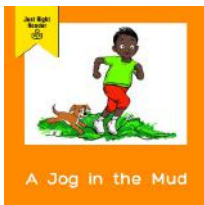
A Jog in the Mud