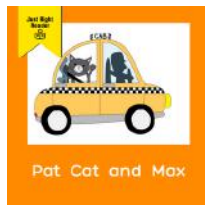
Pat, Cat and Max

More reading and writing fun at JustRightReader.com!