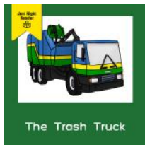
The Trash Truck